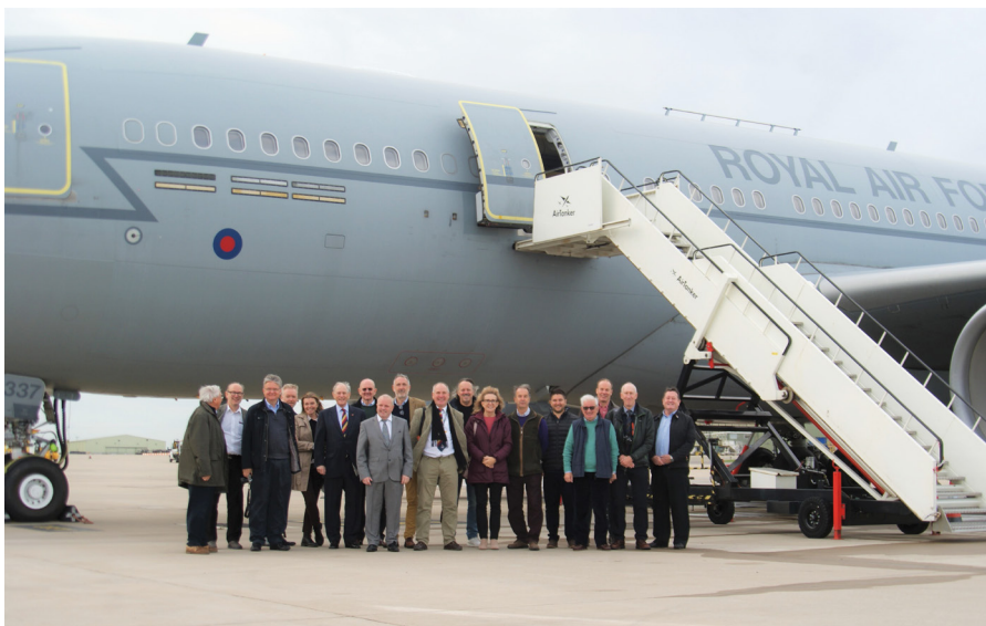
Fuellers gather ahead of the mid-air refuelling experience at Brize Norton

To catch up on all past events please visit fuellers.co.uk