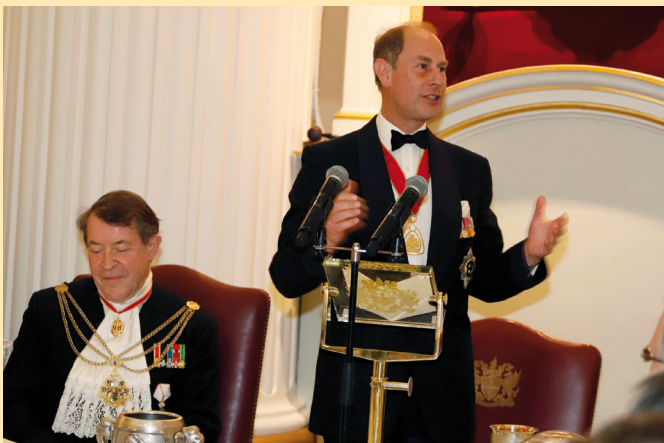
Our new Master The Earl of Wessex expresses his thanks and future views