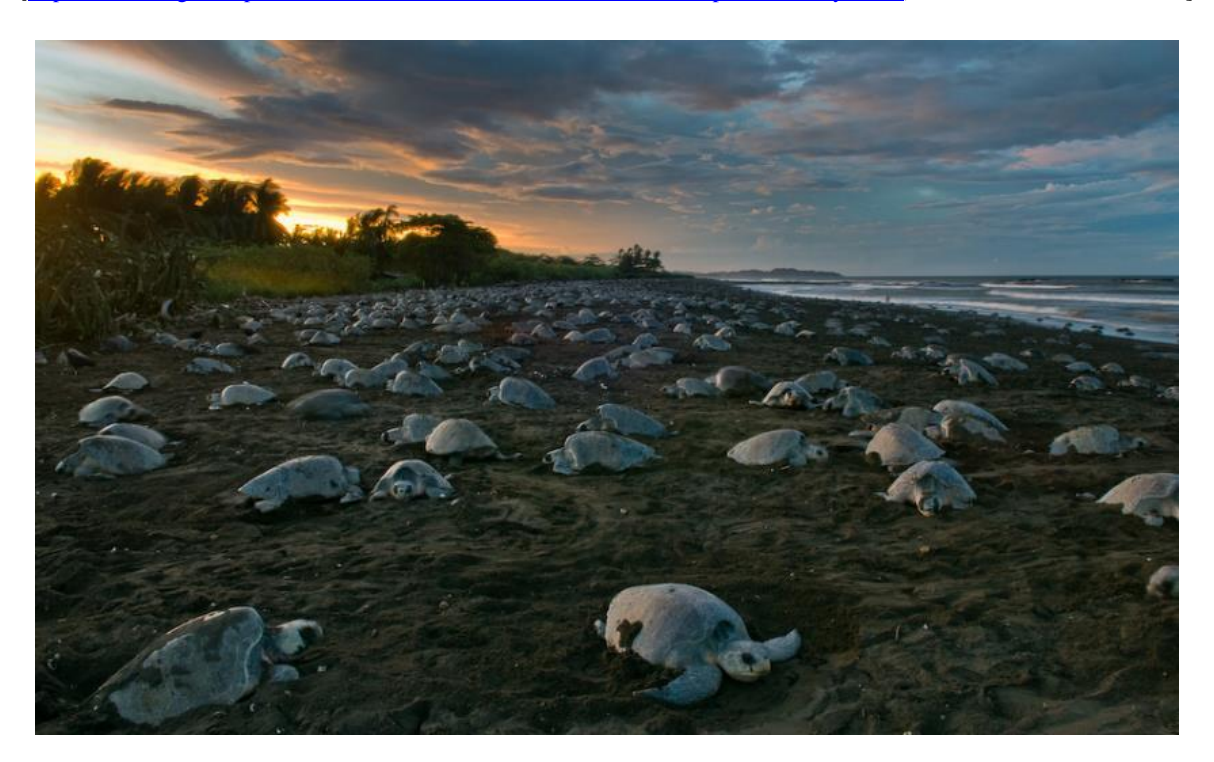
Fig. 3. Olive ridley mass nesting or arribada.