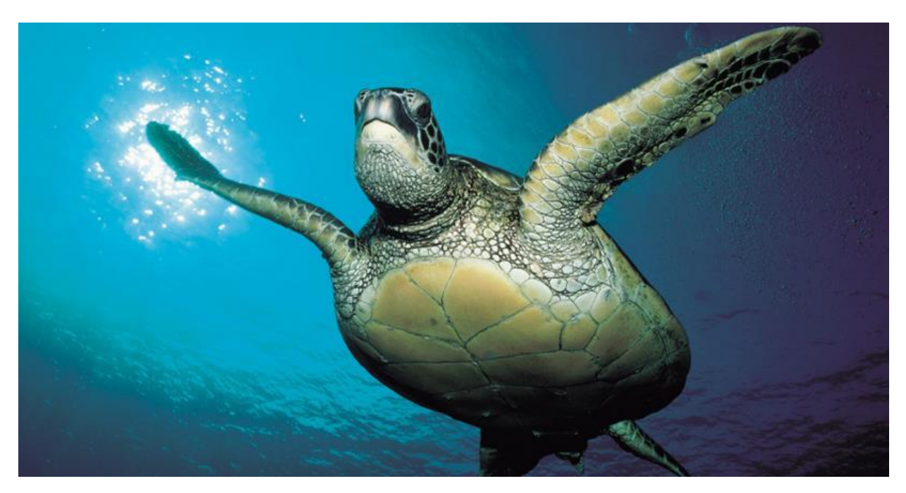
Fig. 1. Olive ridley turtle, Lepidochelys olivacea.