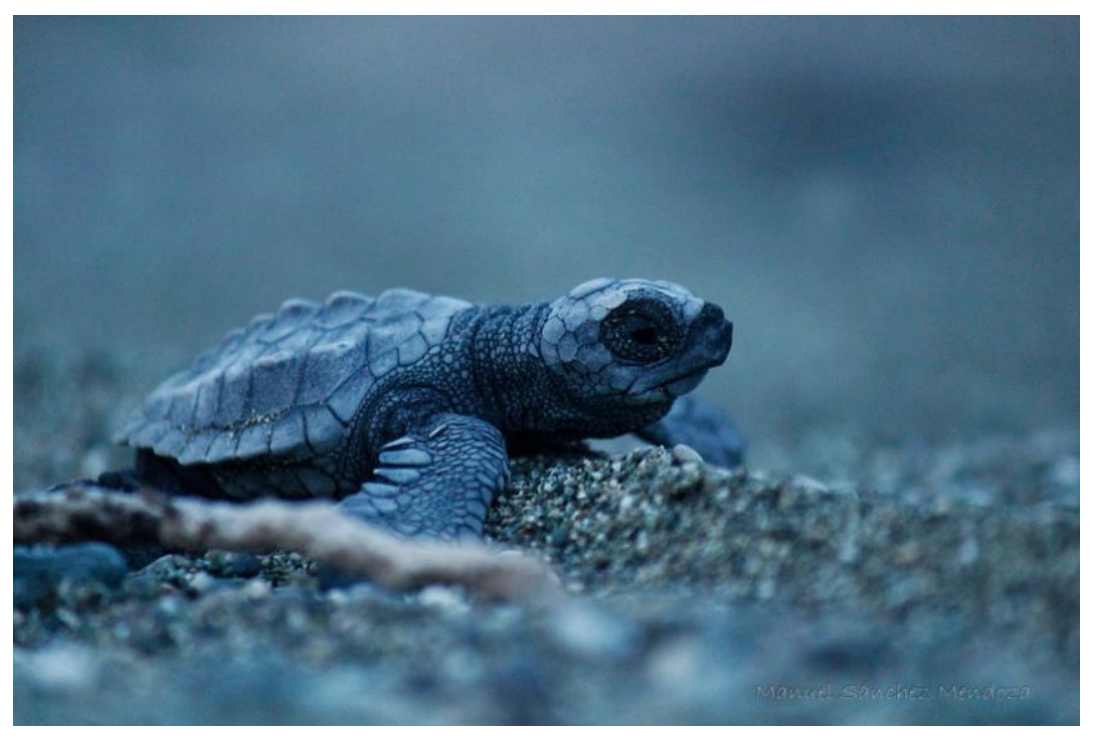
Fig. 5. Olive ridley hatchling.