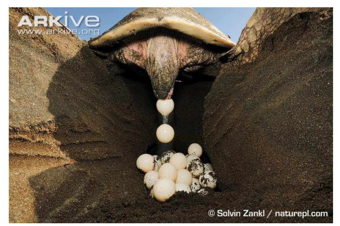
Fig. 4. Olive ridley laying eggs.

[http://www.arkive.org/olive-ridley-turtle/lepidochelys-olivacea/image-G108754.html, downloaded 10 March 2016]