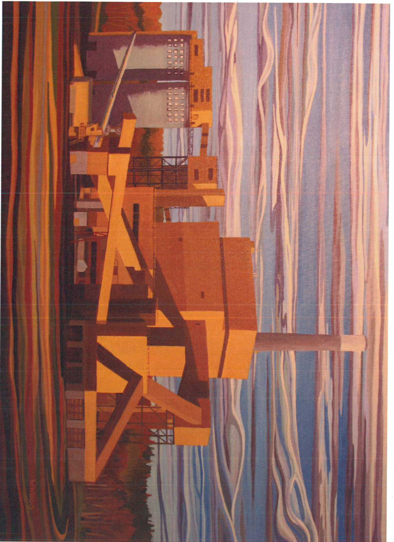
Atikokan Generating Station - Grand Opening, September 10, 2014 Largest Capacity 100 per cent biomass fuelled power plant in North America.