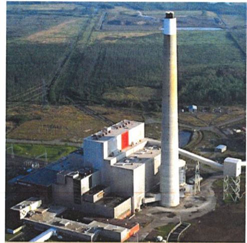
Thunder Bay Generating Station

Since the conversion was announced, last November, OPG has been working to obtain environmental approvals, develop detailed technical specifications, obtain bids from fuel suppliers, select contractors for modifications and negotiate a revenue agreement with the Ontario Power Authority. The unit is targeted to be in-service by 2015.