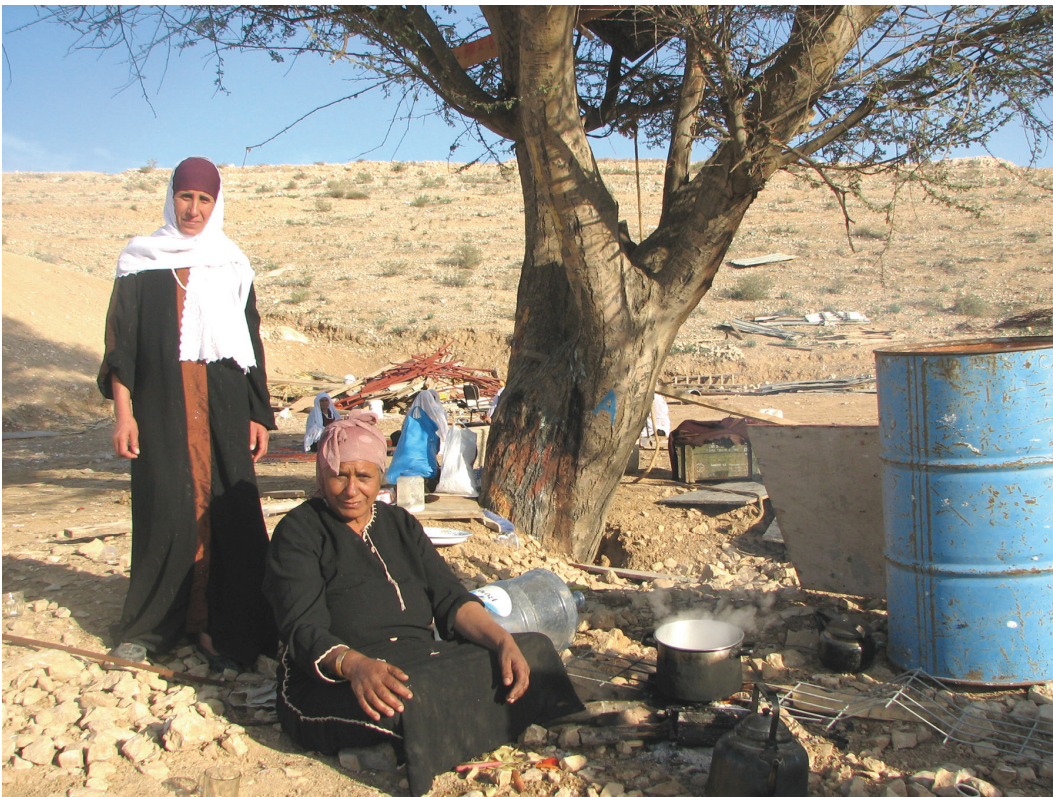
Women in Twayil cook outside after their homes were demolished.

On December 11, 8, 2007, officials from the Israel Land Administration, accompanied by hundreds of police, bulldozers, and trucks, entered the unrecognized Bedouin village of Twayil Abu Jarwal near the Goral junction in the Negev and demolished 20 structures. This was the last of eight times that ILA officials demolished homes of the al-Talalqah tribe in Twayil Abu Jarwal in 2007.