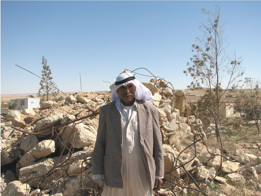
The brother referred to in the above testimony in front of ruins of his house demolished in 1993.

My brother was forced to demolish his house in 1993. The court decision was either a fine and jail or demolish the house himself. My brother had a beautiful house, and it was expensive to build. He had taken loans to build it, and then he had to demolish it. My brother served in the [Israeli] army his whole life and still lost his home. 197