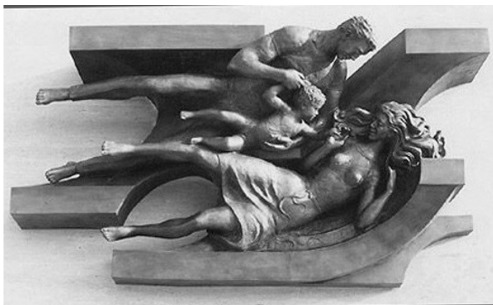
The sculpture, "Family", can be viewed at 2270 Huntington Drive