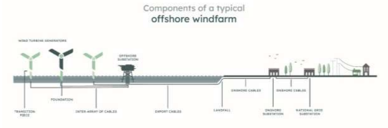
Figure 2: Components of a typical offshore wind farm

Projects such as AyM are considered to be a significant opportunity for cost reduction in offshore wind, given technical expertise and experience on site, as well as existing datasets and environmental studies. These matters are an increasingly important driver in the highly-competitive UK electricity market which aims to deliver the best possible value to the consumer.