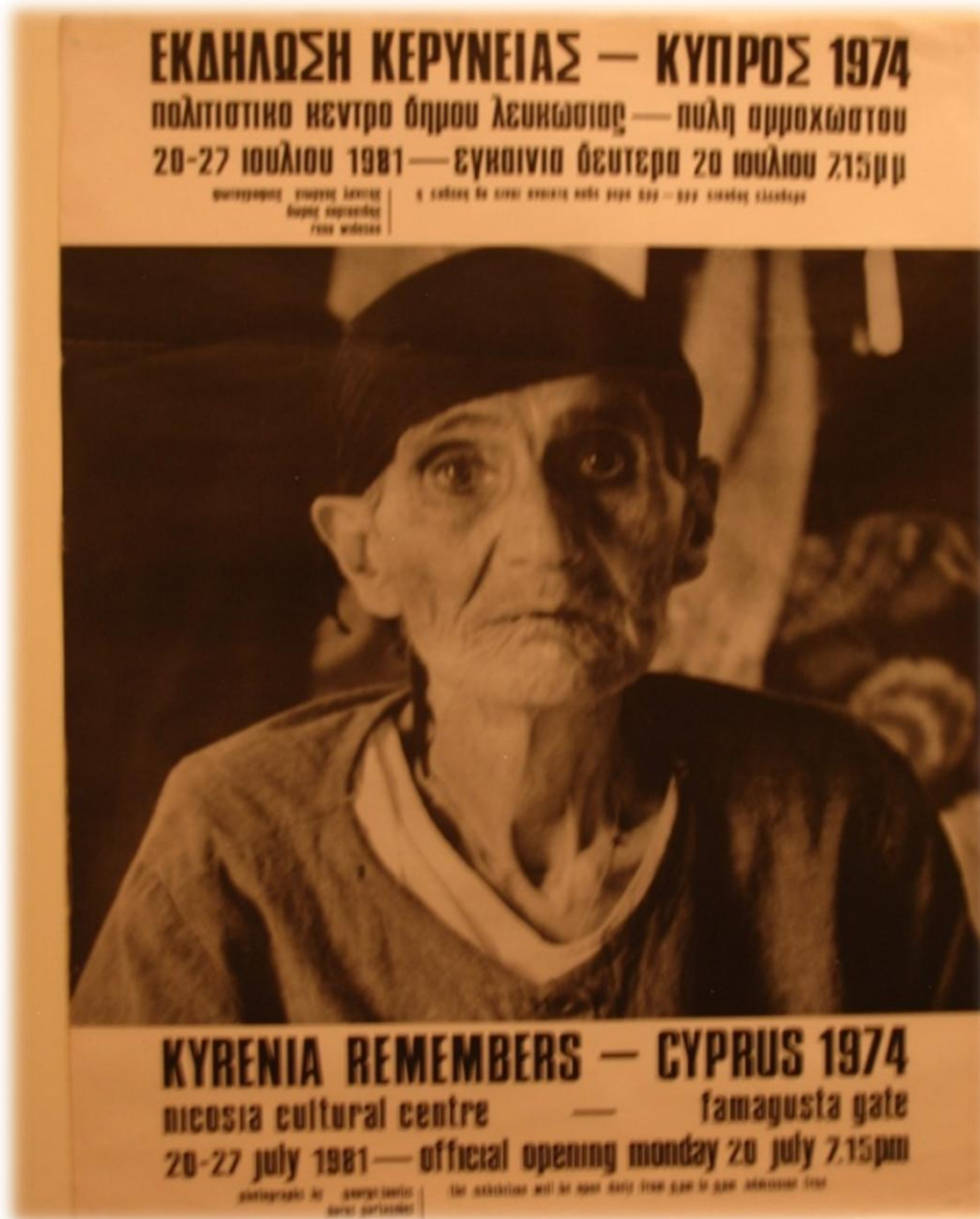
IMAGES 2.3 & 2.4: Posters produced in the 1980s by the refugee association Unconquered Kyrenia, portraying the mothers of the missing and of the fallen soldiers.

Poster 2.3 reads: ‘We demand to know their fates.’ In the context of the Greek-Cypriot national project, women and their embodiment of the national pain have been extensively used to legitimize politico-national claims for international assistance towards the Greek-Cypriot cause, and sanctions against occupier/perpetrator Turkey.