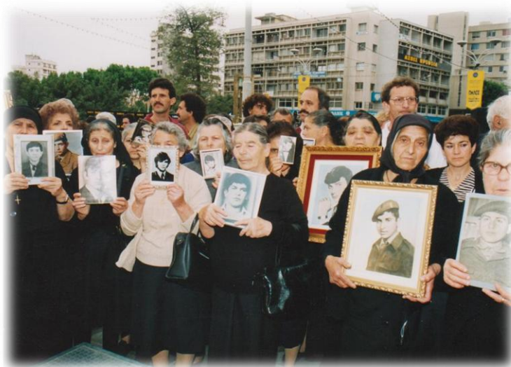
IMAGES 2.1 & 2.2: Greek-Cypriot women dressed in black, holding pictures of their missing sons and husbands at Ledra Palace and Solomos Plaza, Nicosia, during the mid-1990s.