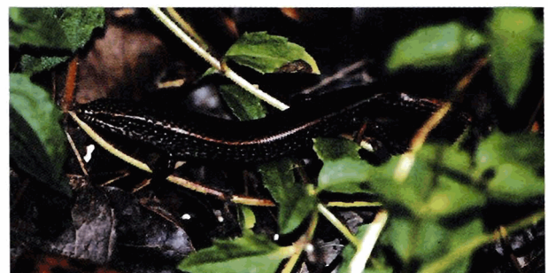
FIGURE. Celestus badius from near the lighthouse on Navassa Island.

• ETYMOLOGY. The specific epithet, badius , is from the Latin, meaning brown or chestnut-colored, presumably in reference to the principal dorsal color of this form.