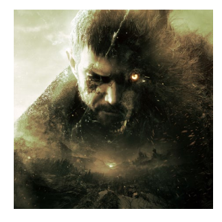
Resident Evil Village Gold Edition scheduled for release on October 28

• Resident Evil series: 131 million units