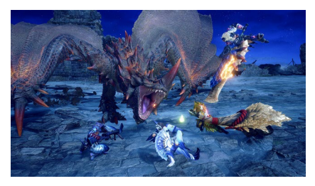
Monster Hunter Rise: Sunbreak