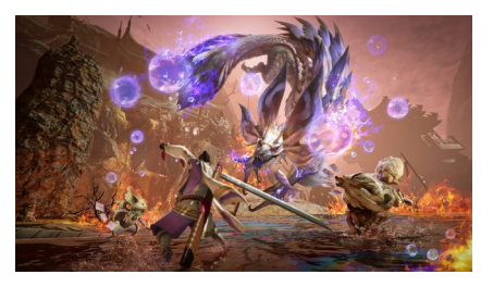
Carrying out free content updates for Monster Hunter Rise: Sunbreak

• Monster Hunter series: 88 million units