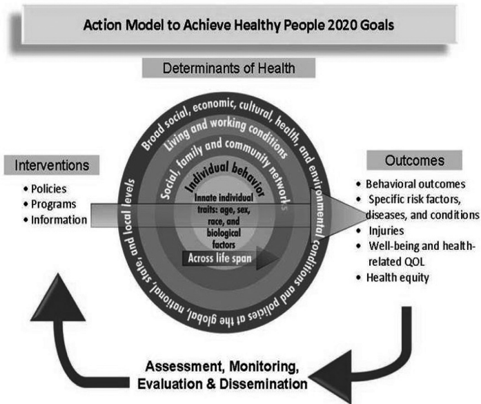
Fig.1. Scientific Advisory Committee Ecological Model Recommended as a Framework for Healthy People 2020.