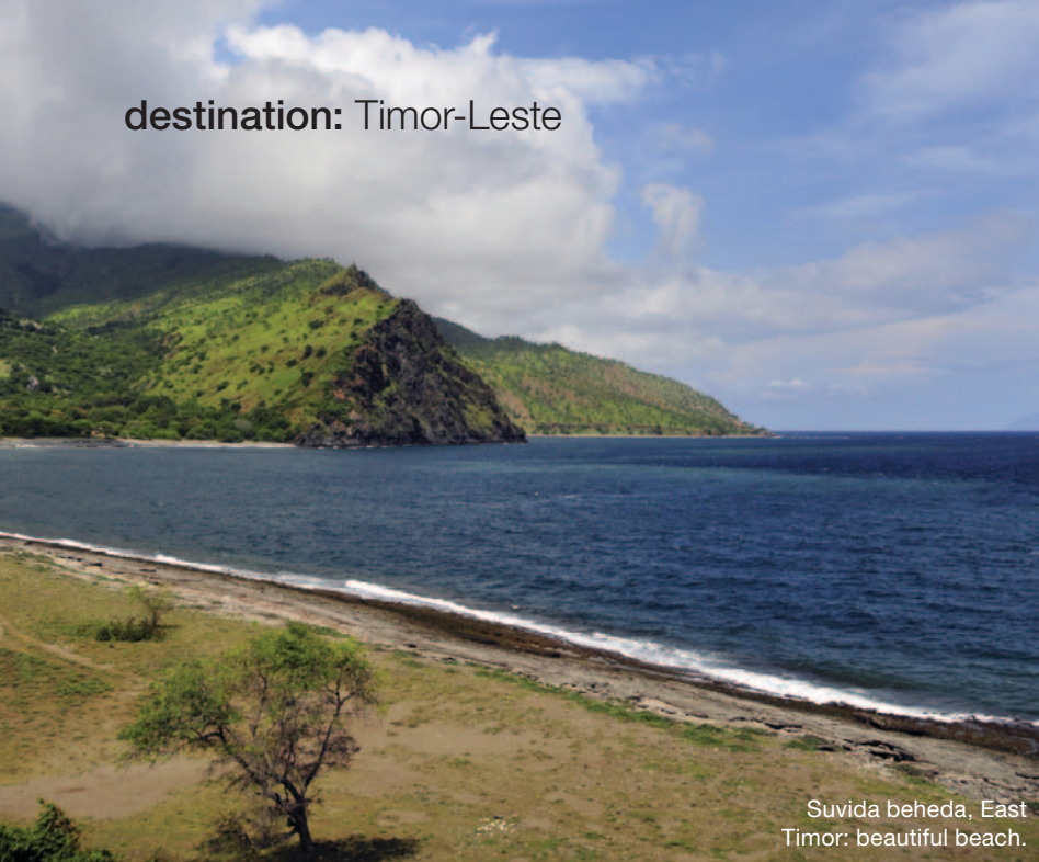
Suvida beheda, East Timor: beautiful beach.

However, like every other country in the world, you are not permitted to bring these goods ashore except as the individual duty-free allowance of crew members where the limit is strictly two litres of alcohol and one carton of cigarettes per person.