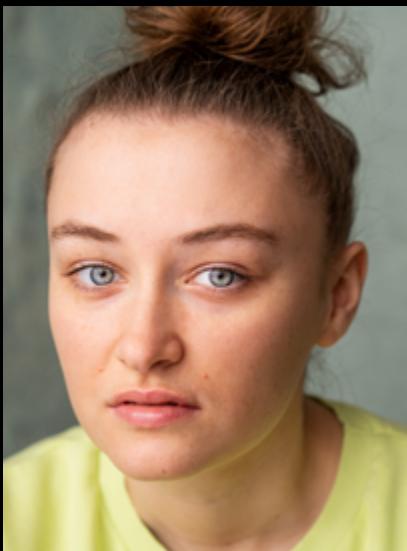
Matilda Rae Squealer