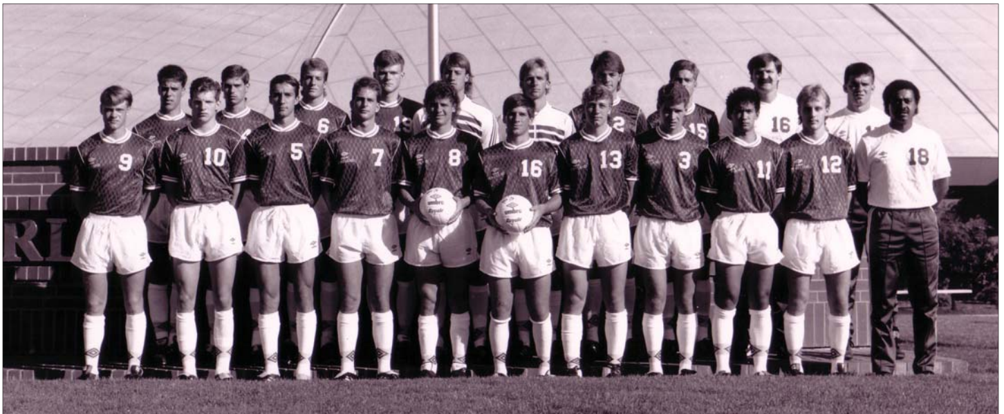
1988 University of Portland Pilots, NCAA College Cup