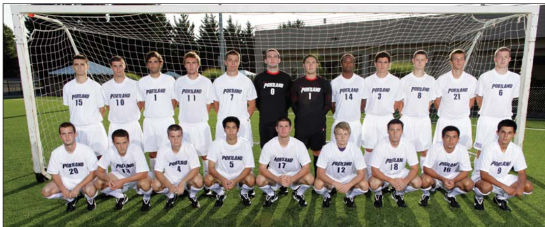
The 2009 Pilots - Reached the NCAA Quarterfinals