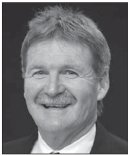
Bill Irwin, 2003-