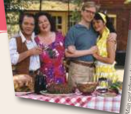
Main cast in front of table