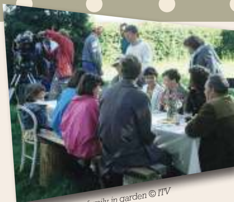
Behind the Scenes family in garden