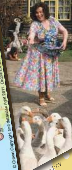
Ma with Ceese