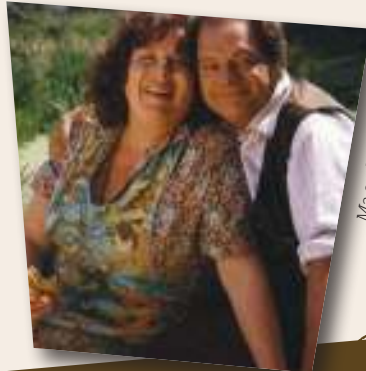
Ma and Pop picnic

Follow this trail and step back in time to those idyllic days portrayed in the series and experience all the sights, smells and tastes that rural Kent has to offer.