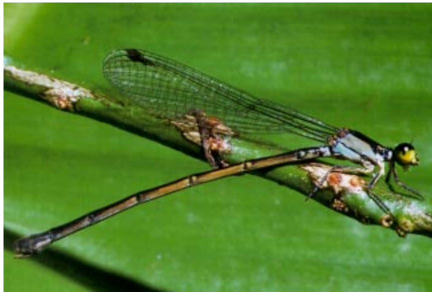
Figure 6: Ischnura luta n. sp., female.