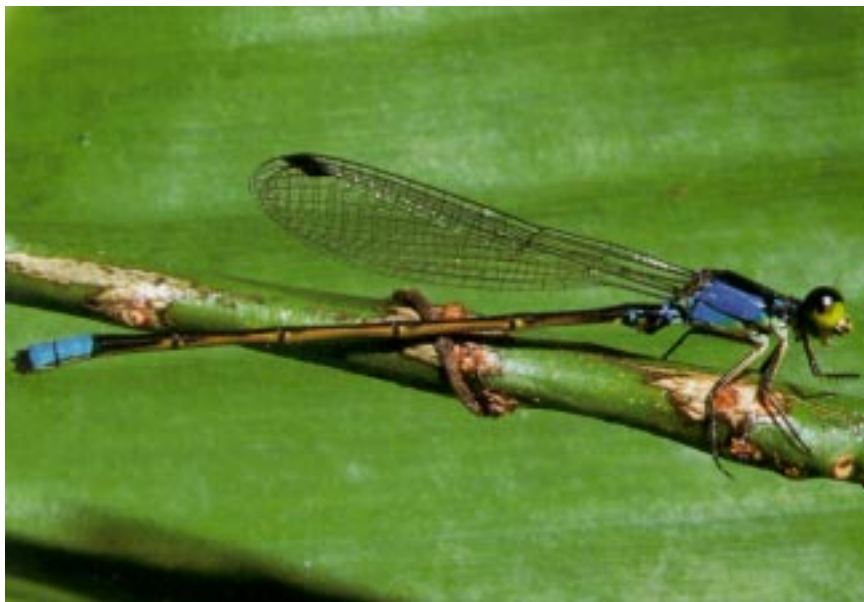
Figure 5: Ischnura luta n. sp., male.