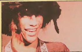
Jamiroqai: Seventies-style funk at its most excellent

VARIOUS: Roadshow Hits (Connoisseur Collection RSCD 20). The watty quotient is inevitably high