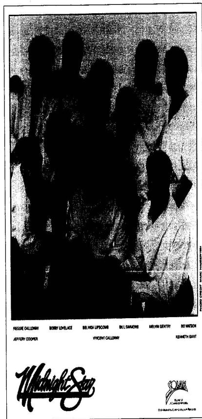
Figure 11.2. SOLAR act Midnight Star.