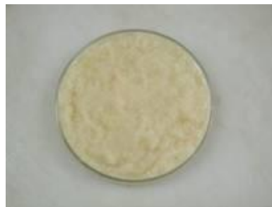
Fig. 19 Crushed and puree garlic