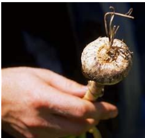
Fig. 22 Basal rot of garlic caused by Fusarium

Fusarium basal rot (Fig 22), is a disease which attacks the basal plate region and the roots. The soil-borne pathogen invades the roots, resulting in empty, tan-colored, non-functional roots. The basal plate region may develop a pinkish growth of mycelium. First visual symptoms are often the yellowing of the tip and dieback of the shoot during the spring. Warm soil temperatures and high soil moisture promote disease development. Since the Fusarium inoculum remains as dormant spores in the soil or on plant residue, crop rotation with crops not belonging to the Allium genus (e.g., garlic, onions, shallots, leeks, chives) is recommended (Bodnar et al., 1998).