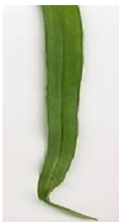
Fig. 4 Garlic leaf

A garlic bulb develops from the bud primordia (2 or 3) of the cloves that are planted. Each bud primordia forms between two and six growing points, each of which develops a lateral bud which later develop into a clove. Temperatures during growth determine the rate of leaf growth ( Fig 4 ), clove, and flower stalk development. Clove formation in non-bolting types differs slightly in that lateral-bud primordia (which form the cloves), form in the axil of the youngest 6-8 foliage leaves, beginning with the oldest one. At maturity, these develop into cloves. The growing point may then either form a clove and go dormant, or form an incomplete leaf that degenerates ( OSU , 2005).