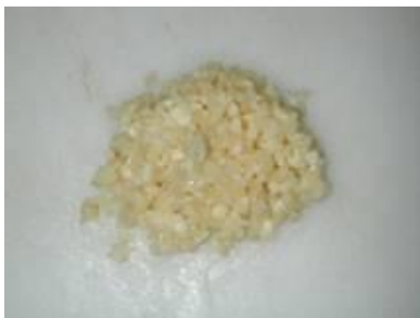
Fig. 18 Sliced and diced garlic