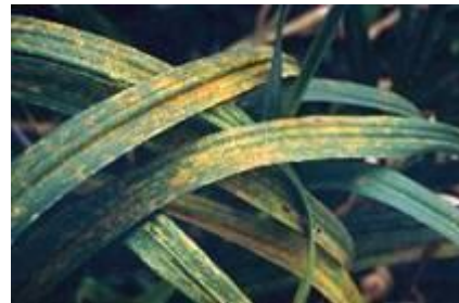
Fig. 24 Rust