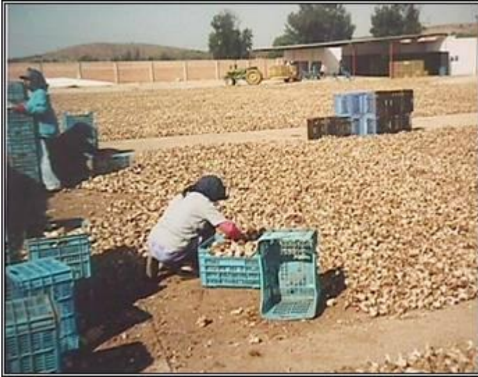
Fig. 14 Garlic picking and yield ( DGTA. CBTA 88, 2004 )

can range from 1,000 to 6,000 lb/acre. Garlic is ready for harvest when the tops become partly dry and bend to the ground (OSU, 2005).