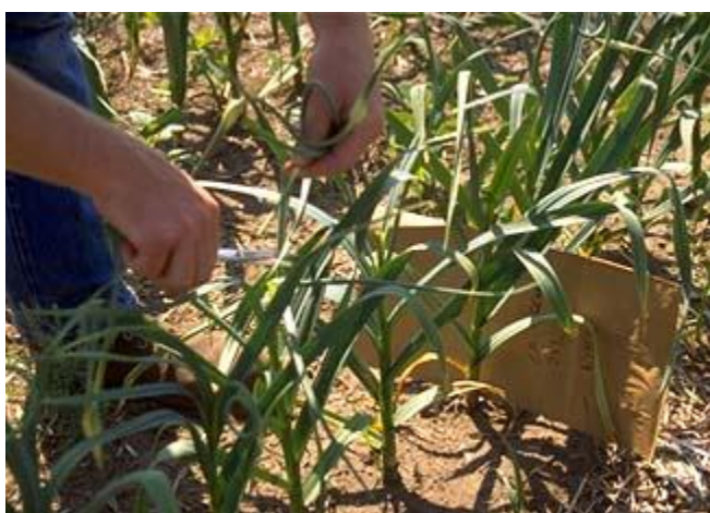
Fig 20 Removal of scapes

For hardneck garlic, a decision needs to be made regarding scape removal. Research in Minnesota has shown that yields can be reduced by 20 percent to 30 percent if the scape is allowed to mature. Yields are most affected in poorly fertilized soil, and only minimally (< 5%) affected in high organic matter, well-fertilized soil. The time to remove the scape is just after the initiation of curling. There is some circumstantial evidence to suggest, however, that bulbs store better if the scape is left on until it turns woody. Scapes can be left on if a market for the bulbils is available to offset the loss in bulb yield. ( Fig 20 ).