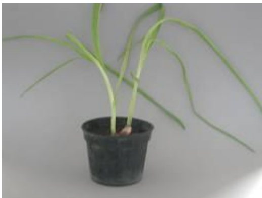
Fig. 3. Garlic plant

Garlic is a perennial that can grow two feet high or more. The most important part of this plant for medicinal purposes is the compound bulb. Each bulb is made up of 4 to 20 cloves, and each clove weighs about 1 gram. The parts of the plant used medicinally include fresh bulbs, dried bulbs, and oil extracted from the garlic. ( UMM , 2004). The Bulb, 12 inches to 18 inches tall (30-45 cm), 9 inches to 12 inches in spread (22.5-30 cm) ( Figure 3 ).