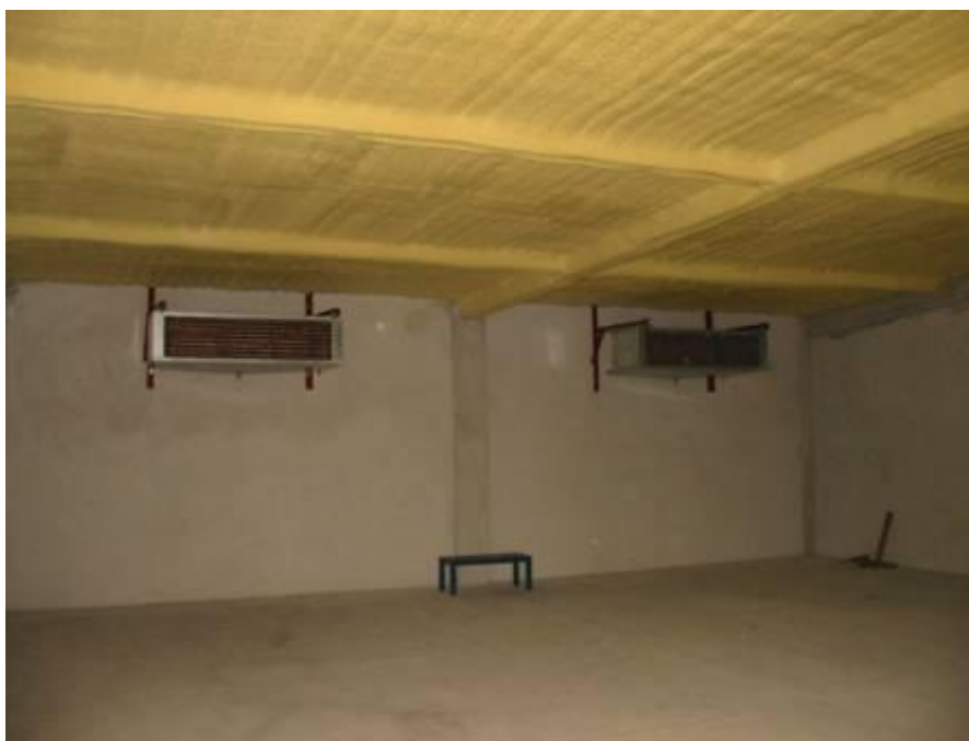
Fig. 16 Cooling room for garlic