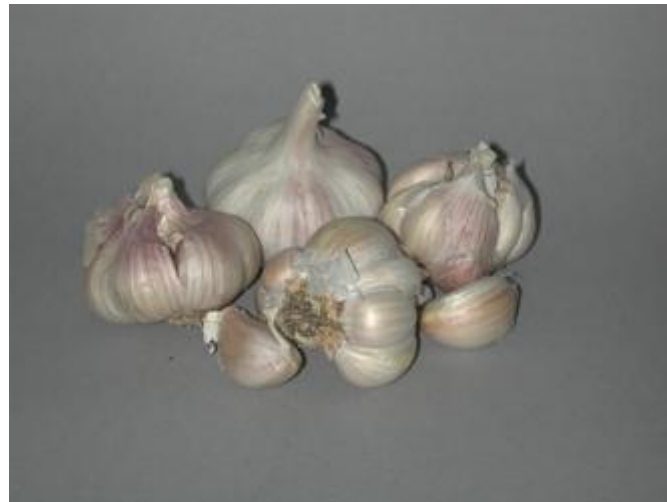
Fig 2 Typical garlic (DGTA. CBTA 88, 2004)

The percentage composition of typical garlic is: the portion of the plant most often consumed is an underground storage structure called a head. A head of garlic is composed of a dozen or more discrete cloves, each of which is a botanical bulb, an underground structure comprised of thickened leaf bases. Each garlic clove is made up of just one leaf base, unlike onions, which are composed of numerous leaf layers. The above-ground portions of the garlic plant are also sometimes consumed, particularly while immature and tender ( Wikipedia , 2006) ( Fig 2 , Typical garlic)