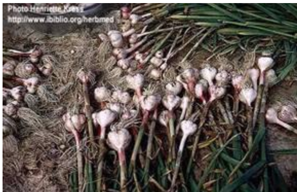
Fig 6. Hardneck garlic

bulbs typically have many more cloves than the hardneck types, some of them small central ones, thought to be converted remnants from what once would have been a bulbil stalk. The leaves form a pseudostem above the ground, which softens and falls over as the garlic matures, very much like the tops of an onion. These are the garlics of the mainstream marketplace, because they yield more, store better, and require less maintenance in the field than the hardnecks (Fig 6). The soft, pliable stems also make them the garlics of choice for braiding. Softneck cultivars may be less hardy than hardnecks in cold winter areas (Fig. 7). Botanical purists, such as Rexford Talbert, insist on a third subspecies, A. sativum pekinense, although popular literature seldom if ever mentions this type, or describes how it is set apart from the hardneck, Allium sativum ophioscorodon, variety (Heirloom Vegetables, 1998) (Table 1 and Table 2).