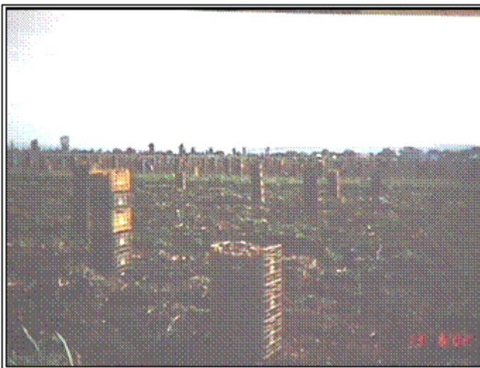
Fig. 13 Harvest tool with garlics ( DGTA. CBTA 88, 2004 )