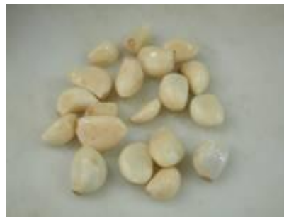
Fig. 17 Whole peeled garlic