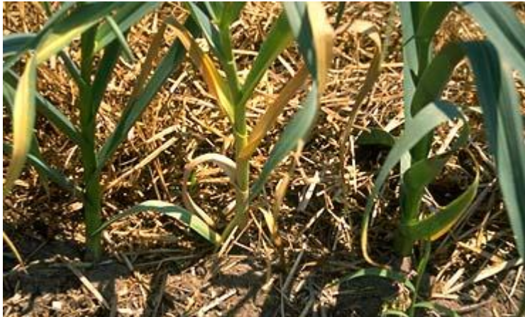
Fig 21. Foliar symptoms of Fusarium

(white rot has been known to persist in soil for ten years), destroying infected tissue, and planting disease-free seed stock.