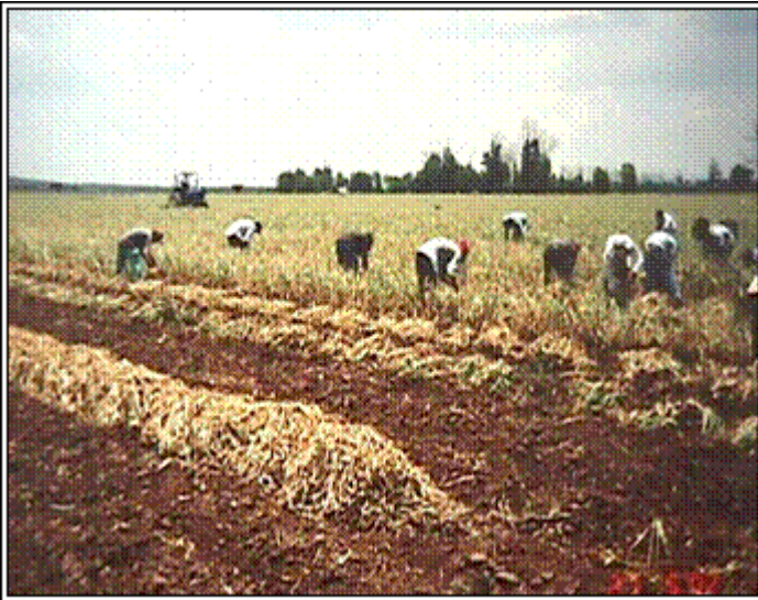
Fig. 12 Harvest of garlic by hand ( DGTA. CBTA 88, 2004 )

leaves have turned brown, but there are still mostly green leaves higher on the plant, it's time to harvest (Figures 12 and 13). Others suggest harvesting when the hardneck scapes are standing straight up but before the pods containing the bulbils open up. You can always test dig one or two plants. You should be able to see the shape of the cloves beginning to bulge through the wrapper. On the High Plains, depending on the weather, harvest can begin as early as the first week of July. There is also a two to three week difference in the harvest dates of the several varieties. So watch you plants carefully. To get the bulb out of the ground, don't just try to pull them. The stalk will break. You must dig, using a pitchfork or the like in order to loosen the soil. Then you can lift the entire plant out of the ground. Don't let the bulb stay in the sun very long as it will sun scald, which reduces its quality ( The garlic store , 2003).