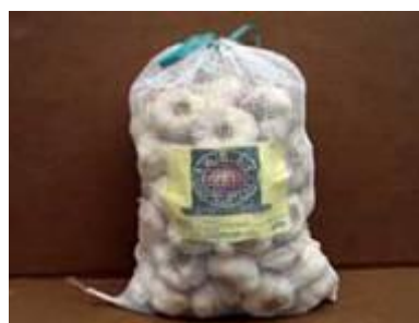
Fig. 15 Packing garlic forms