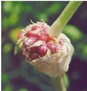
Fig. 5 Garlic flowers

flowers vary in number, or may be absent. In many cultivars, these flowers wither as buds, without opening. Even those that open and occasionally produce black withered seeds are sterile, however ( Garlic and friends , 1996) ( Fig. 5 ).