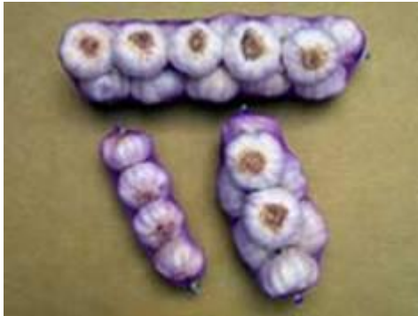
Fig 11 Garlic typical product (USDA, 2003)

best a temporary fix. Because of its strong odor, garlic is sometimes called the "stinking rose" (Wikipedia, 2006).