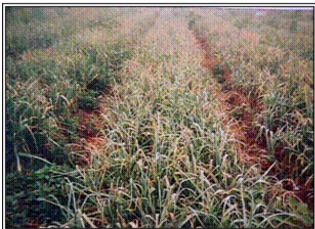
Fig 9 Cultural practices of garlic ( DGTA, CBTA 88, 2004 )

Curing and Storing: Whole plants should be moved from the field into a dark, dry, well-ventilated area for drying and curing of the bulbs. Bulbs should be moved out of the sunshine as quickly as possible after digging. Do not dry by laying the plants in the sunshine. Tops and roots are allowed to remain on the drying bulbs. After several weeks, drying and curing should be complete, and the unique flavors fully developed within the bulbs (Most garlics will taste fairly similar, fresh from the ground). Tops and roots can be removed once drying and curing are complete. Depending on variety, the bulbs should store for 4-12 months, once they are properly cured. Best flavor also develops during curing. If garlic is planted fairly early in the fall, a cover crop of oats can be sown at planting time to try to provide some winter cover for the young garlic plants. In cold-season, low snow cover areas, a layer of organic mulch, applied after the ground freezes, is usually recommended for fall-planted garlic. Materials such as shredded leaves or straw can be used as mulching materials. This should stabilize the young plants, preventing frost heaving, cold injury, or premature growth in the late winter ( Voigt, 2004 ).