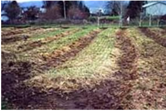
Fig.8 Soil type garlic ( DGTA, CBTA 88, 2004 )