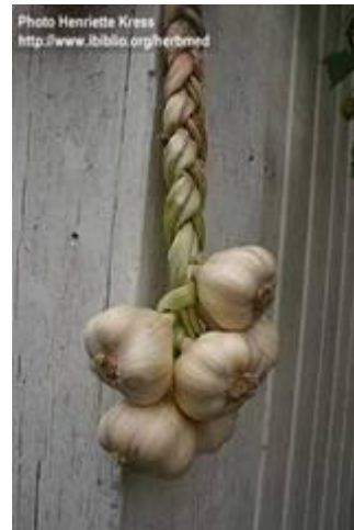
Fig. 7 Softneck garlic