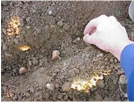
Fig. 10 Propagation of garlic