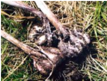
Fig. 23 White rot

Pests : All pests that attack onions will affect garlic crops. The most significant pest is likely to be nematodes (eelworms) which attack the roots and bulbs. Bulbs should be inspected before planting to ensure cloves are nematode-free and if possible dusted with nematicidal powder immediately prior to planting. Thrips and onion maggot are two other potentially serious pests