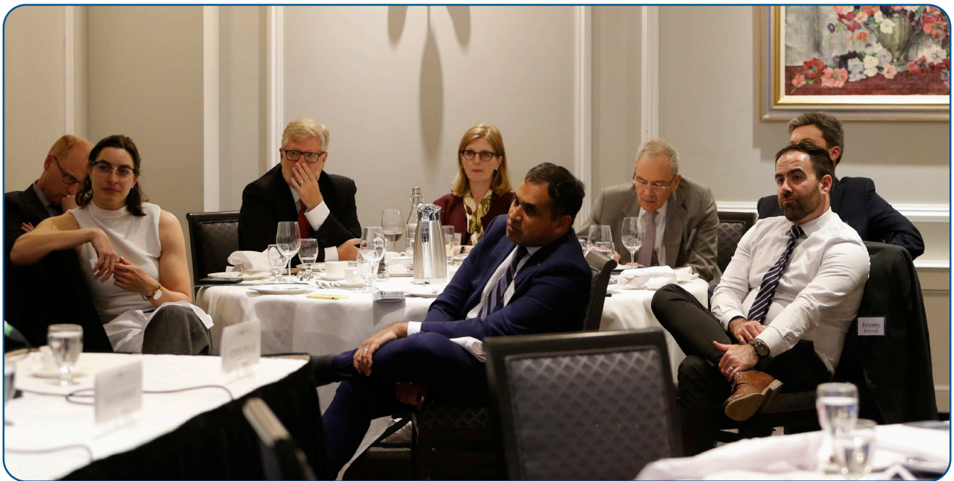
Patrons' Circle Event: Inflation: The Threat and the Response