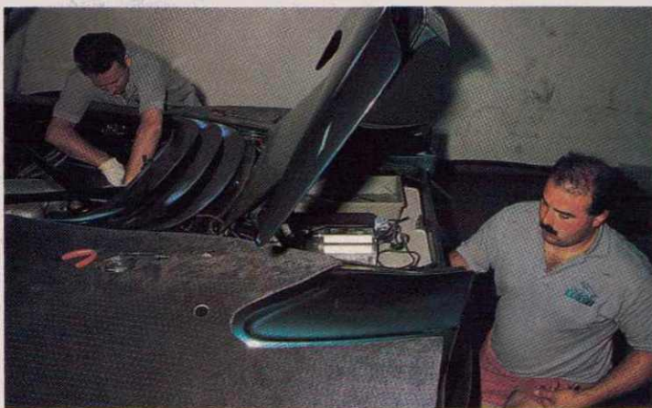
Mechanics take the catalysts off and adjust rev limiter for the record run (below). Notice the massive straight-through twin exhausts (bottom)

Mind you, the bumpiness of the circuit surprised me. Look at the surface, from the trackside, and it seems as smooth as glass. Drive on it, at 200mph-plus, and the tiniest pimples kick the car's suspension, in turn kicking you. My helmet was rattling against the glass roof the whole time, as it bobbed up and down, at one with the car's tortured springs.