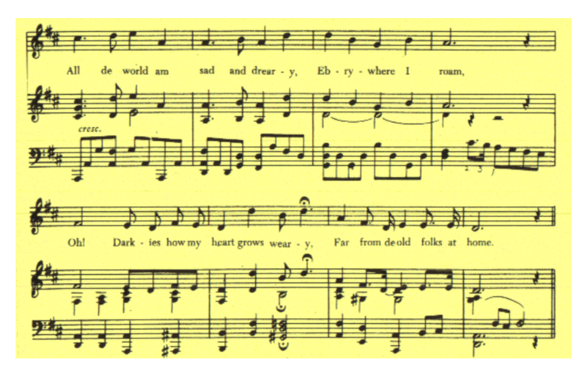
Example 2. Excerpt from Stephen Foster's "Old Folks at Home" in Joseph E. Maddy and W. Otto Miessner, compilers and editors, All-American Song Book . New York: Robbins Music Corporation, 1942, p. 108.

It was during this period that the nation suffered from the economic disasters and dislocations created by the Great Depression, the political cauldron that boiled over into World War II, and the upheavals in the national government that resulted in the New Deal of Franklin Delano Roosevelt. It is possible that remembrances of times past, times more placid and predictable, found their musical analogy in the sentiments expressed by Foster's dislocated slave. The fact that those times were not as nostalgic for the descendants of the slaves who, like Foster's protagonist, were less than enthused about life on "de old plantation" would not have occurred to them. Florida, in 1935, was a racially segregated state.