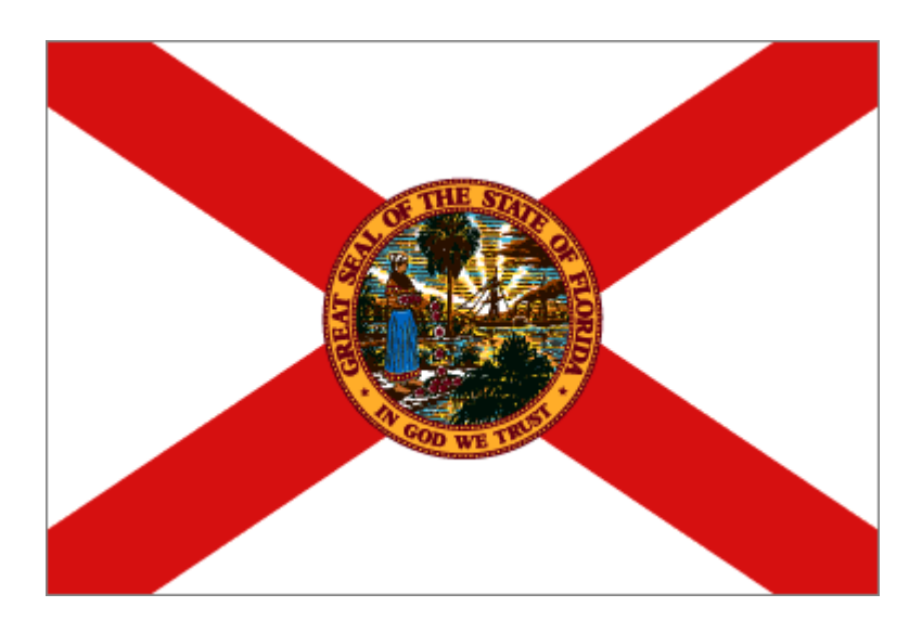
Plate 2. Florida State Flag

One is struck immediately by the fact that Waugh's words, set to the stirring "O Tannenbaum" music, had already been adopted by many of the state's public schools as part of the daily regimen. The Florida legislature undoubtedly observed that the song promoted love for home and state and, consequently, recommended (but did not require) that it be sung not only in the school setting but also at "all public gatherings where singing forms part of the program." Prior to the time in which the song "officially" served the citizenry, the Florida State Flag (see Plate 2) was adopted by Joint Resolution No. 4, Legislature, 1899, and ratified in the general election of 1900. The State Flower, the orange blossom, was so designated by Concurrent Resolution No. 15, Legislature, 1909, and the State Bird, the mocking bird (see Plate 3) was so declared by Senate Concurrent Resolution No. 3, Legislature, 1927.