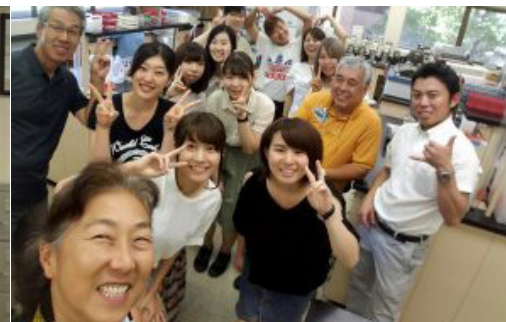
Niigata University & UHM 2017