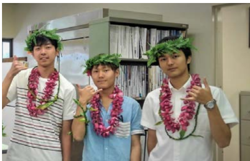
Niigata University Students