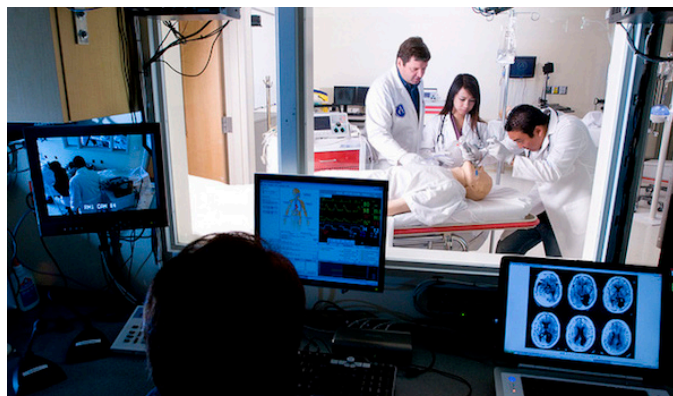
SimTiki Simulation Center