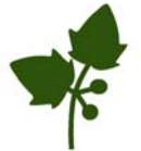
Table 1. Department of Native Hawaiian Health Cultural Competency Initiatives Cont.