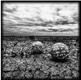
Left: Bitter Harvest , an image from the exhibition