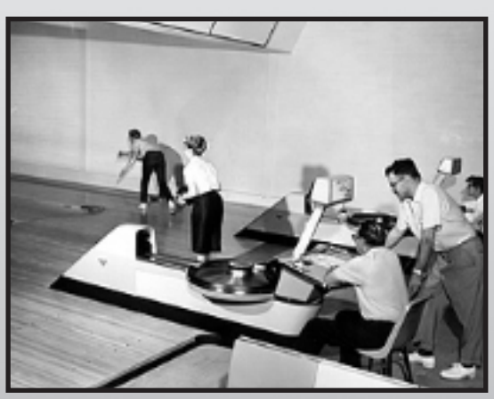
Mercury Bowl was a popular retreat after a long shift.