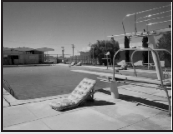
The Olympic-size Mercury swimming pool opened for business in 1964.