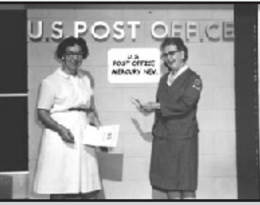
The Mercury Post Office on opening day, October 1964.

Mercury, Nevada, a town 65 miles northwest of Las Vegas, is the gateway to the Nevada Test Site (NTS), now known at the Nevada National Security Site (NNSS). There is no evidence as to how Mercury was named, but legend says that an unknown miner worked in the Calico Hills in the 1850s mining mercury-