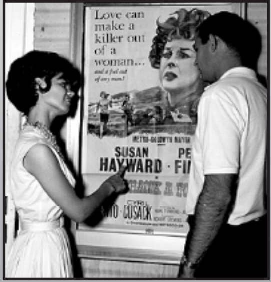
The movie theater at Mercury played current features for a nominal admission.

bearing ore. His route of travel became known as the Mercury Road, and the area surrounding it became known as Mercury. Almost one hundred years later the Atomic Energy Commission (AEC) built Mercury into a thriving area containing many of the facilities, services, and amenities as other small towns in the U.S., only without public access.