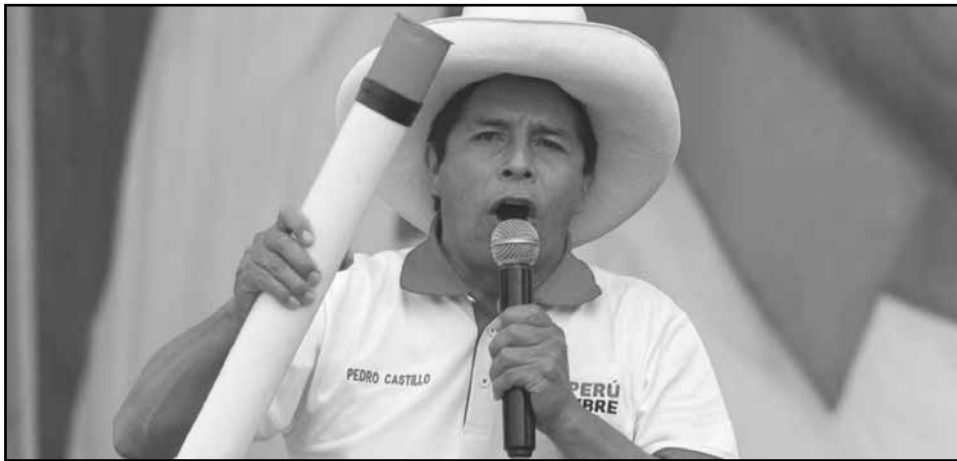
Schoolteacher Castillo is resisting the erasure of his electoral victory by the right wing.

[As TTT was going to press], the JNE had another hearing where the plenary will process another eight requests for the annulment of minutes presented by Fuerza Popular. Meanwhile, social organizations continue to gather in Lima, demanding the proclamation of Pedro Castillo as the new president of the nation.