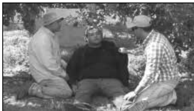
Farmworkers have been dropping and even dying from the heat in PNW and elsewhere-screenshot from UW film.

over a hundred thousand people at ~ 82 F. If sweat won't evaporate, our body temp rises, continuously. And when body temp hits ~108, we're dead. For a vulnerable person in wet bulb temp, this takes much less than an hour. Up until the last ~ 40 years, wet bulb temperatures were extremely rare on this planet. But now we're seeing multiple wet bulb temperatures per year in multiple locations. By mid-century, parts of the Southeastern U.S will see weeks of wet bulbs every year. This is quite bad. Thousands of people will die on each of those days. This is an active area of climate science and resilience study: https://research.noaa.gov/article/ArtMID/587/ArticleID/2621/Dangerous-humid-heat-extremes-occurring-decades-before-expected . Many of the places humans currently live on the planet are on their way to being functionally uninhabitable by humans."