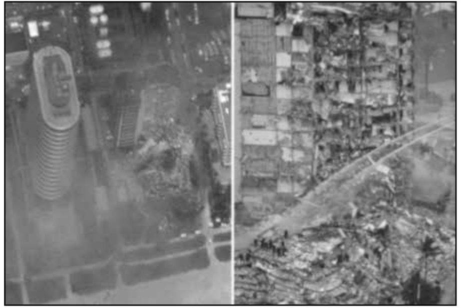
What lessons can be learned from tragic condo collapse in Miami?

Diagonally across the content from the terrible toll in the Miami collapse is the deadly heat spike in the Pacific Northwest, another product of human hubris and the destructive environmental impacts of capitalist industrial operations and practices. Temperatures of 116 degrees Fahrenheit in Portland OR are unprecedented in recorded history, and are not just the result of a transient weather anomaly, the so-called "heat dome" over much of the western US, but of the global heating caused by runaway