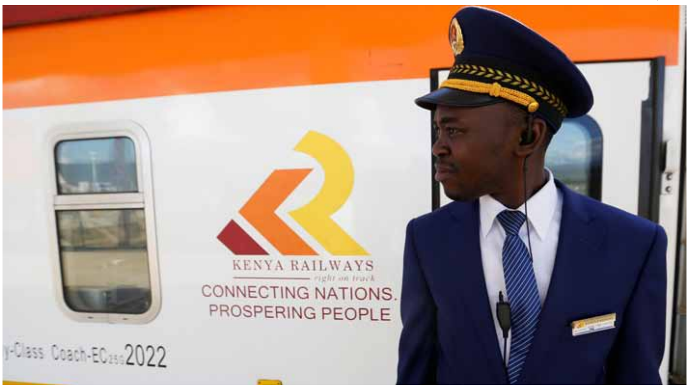
A Kenya Railways attendant stands before a Standard Gauge Railway carriage in Mai Mahiu. The railway was financed by the Chinese government.