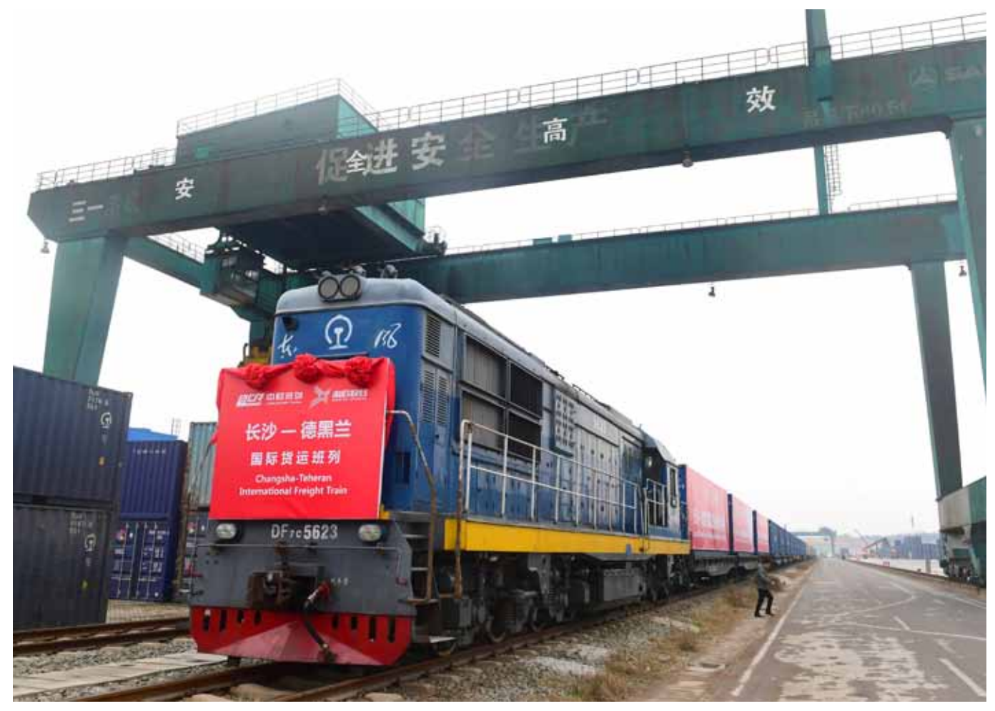
A China Railway Express train leaves Changsha, central China, for Tehran. China is keen to incorporate Iranian links into the Belt and Road infrastructure.

The geopolitical realities have turned out differently. The re-imposition of US sanctions on Iran after the United States' withdrawal from the JCPOA put a chill on China—