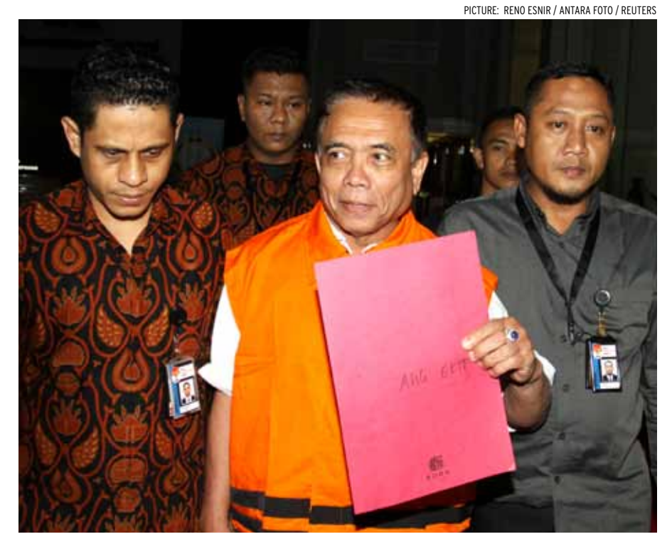
Irwandi Yusuf, governor of Aceh province, with Corruption Eradication Commission (KPK) officers after his arrest in June 2018. Many fear that proposed changes will weaken the agency.

It appears reasonable from a political perspective for Jokowi to postpone the problematic laws, but he has yet to issue a Perppu. There was strong resistance to the Perppu proposal from the political elite. Both the government coalition and the