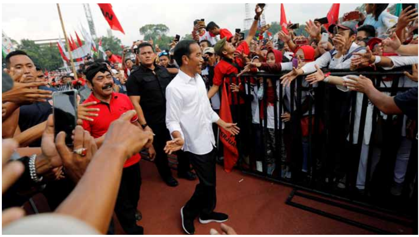
A 'simple and concrete' understanding of democracy: Joko Widodo greets supporters at a campaign rally in Solo, Indonesia, in April 2019.

fuel prices or revising the Manpower Act—he will have the benefit of being able to ignore the demonstrations and protests because he cannot seek re-election. But this political dynamic may not be the same for his supporting coalition. Although Jokowi cannot run again in 2024, his coalition parties still need to compete in the next election, creating different political incentives.