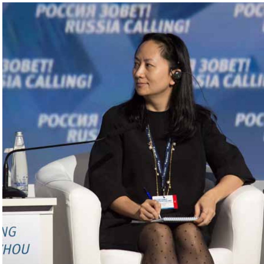
Huawei chief financial officer Meng Wanzhou: in the sights of US authorities.

Governments are not just struggling to understand these new problems. They are even struggling to understand the consequences of their own and their predecessors' past decisions. For instance, the policymakers who agreed on the current tax rules could hardly have predicted that one day an entire department store would fit into a phone and be exported across the world as a service. In 1996, trade negotiators agreed to slash import