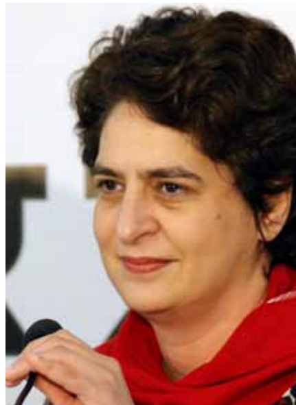
Priyanka Gandhi Vadra: a potentially powerful attraction for women voters.

Modi and the BJP believe they have a following among devout Hindu women who like the idea of a strong Hindu leader as embodied in Modi. The government has also instituted a program, popular among women in north India, of providing subsidised gas cookers to poor families. The cookers save women hours of labour collecting fuel for open fires and spare them the inhalation of harmful smoke.