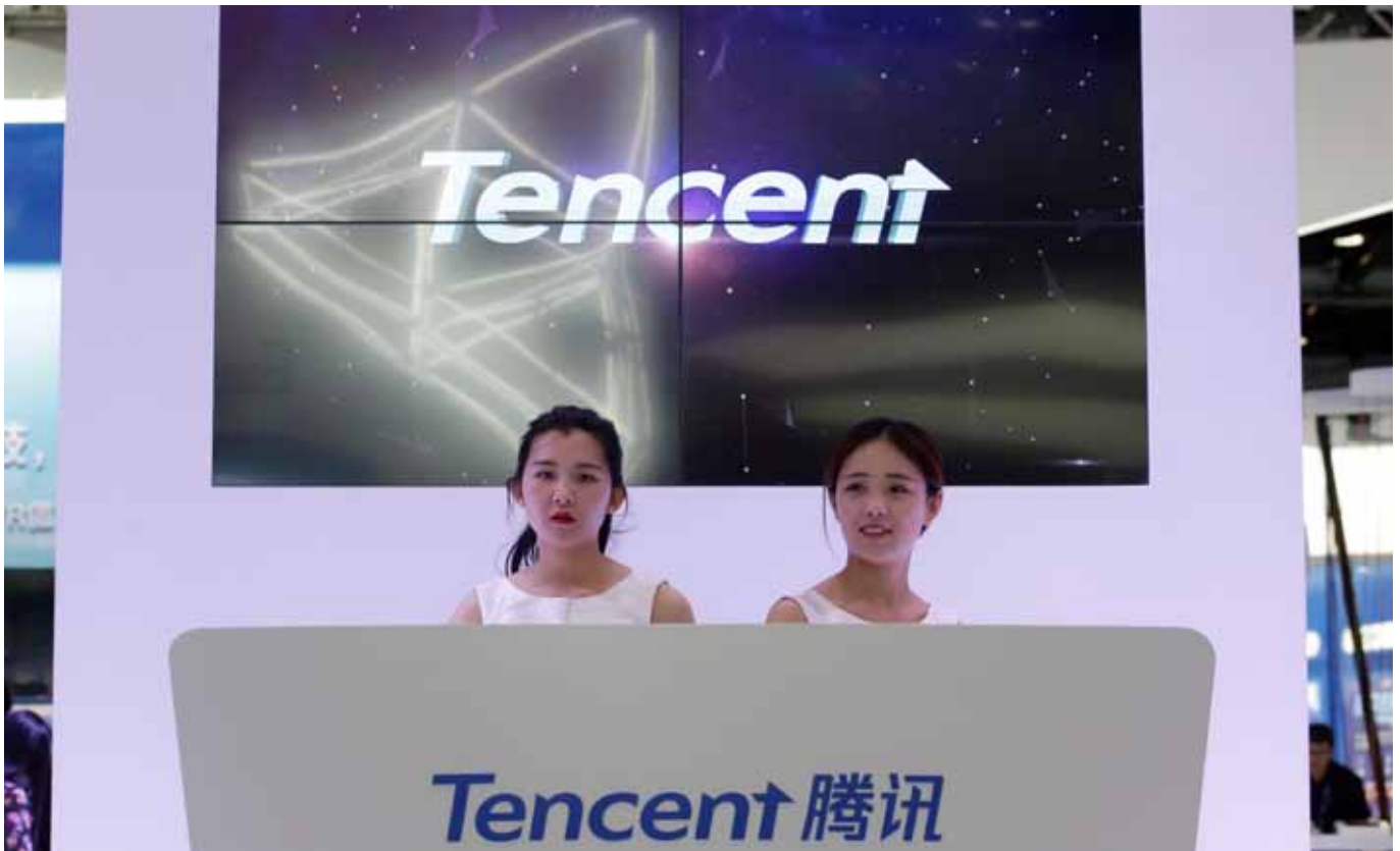
A Tencent welcome desk at the Global Mobile Internet Conference in Beijing in April 2017. The availability of cheap and affordable smartphones has brought the internet revolution to lower-income Asian countries, and created new tech billionaires along the way.

A second (and related) challenge is the protection of privacy, which appears to be a novelty in many Asian jurisdictions. Approximately 10 billion data records have been breached in various attacks since the early 2000s. In response, countries like Japan, China, South Korea and Singapore have followed a European legal model that restricts access to personal information from abroad. Businesses must protect customer data, hire data protection professionals and alert the authorities of breaches. Meanwhile, other governments such as Thailand, Cambodia and Laos are yet to implement regulations that recognise the idea of personal information.