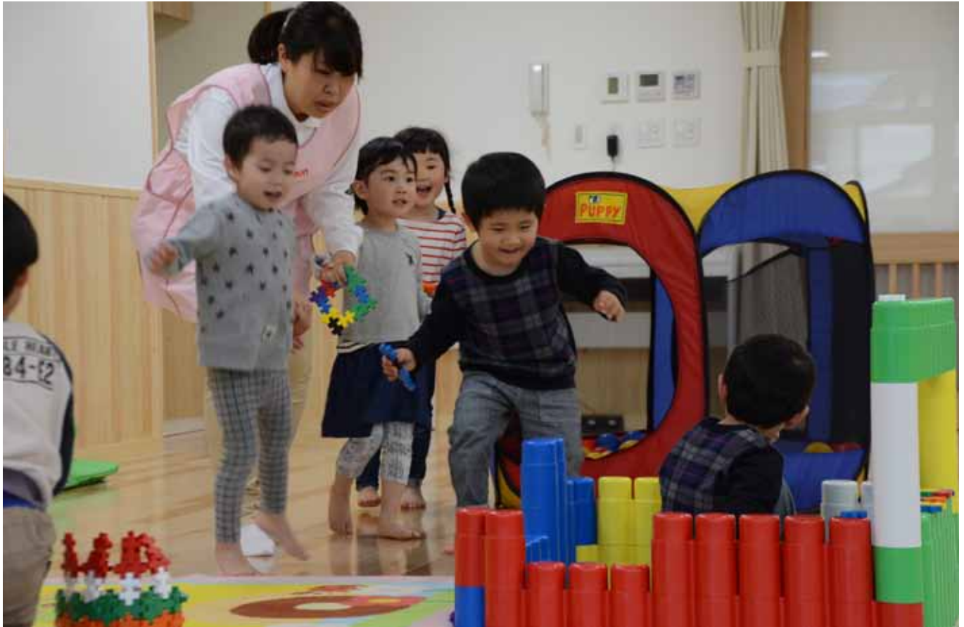
Playtime at a Babu Land childcare centre at a Toyota plant in Japan. High-quality daycare has proved to be a boon to working parents.