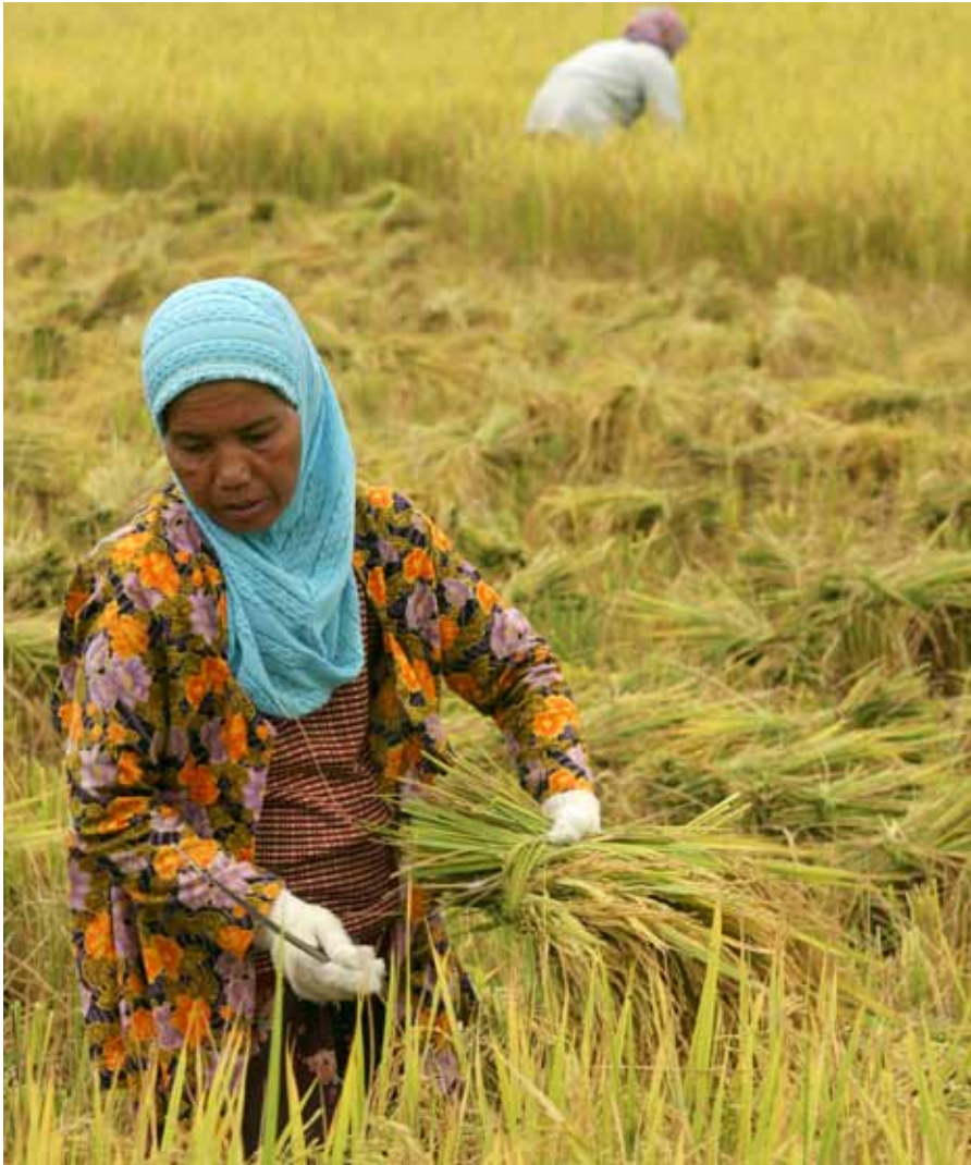
Harvesting rice in Indonesia's Aceh province: civil society organisations are changing expectations.

decision-making forums, review and evaluation working groups, and district-level planning forums. In one district in East Java their schools have been so successful that the district government is now investing in the program so that it can reach more villages.