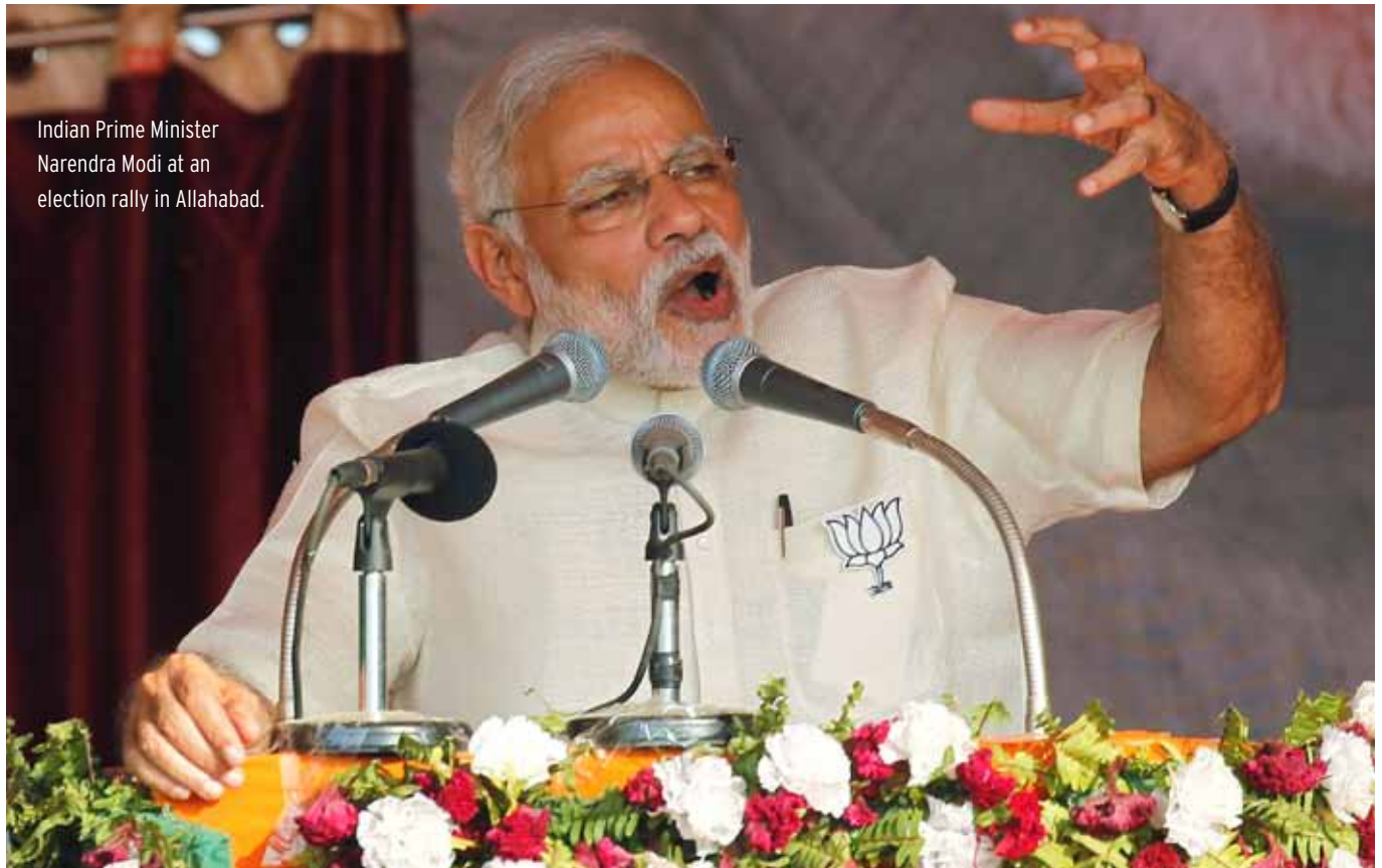
Indian Prime Minister Narendra Modi at an election rally in Allahabad.