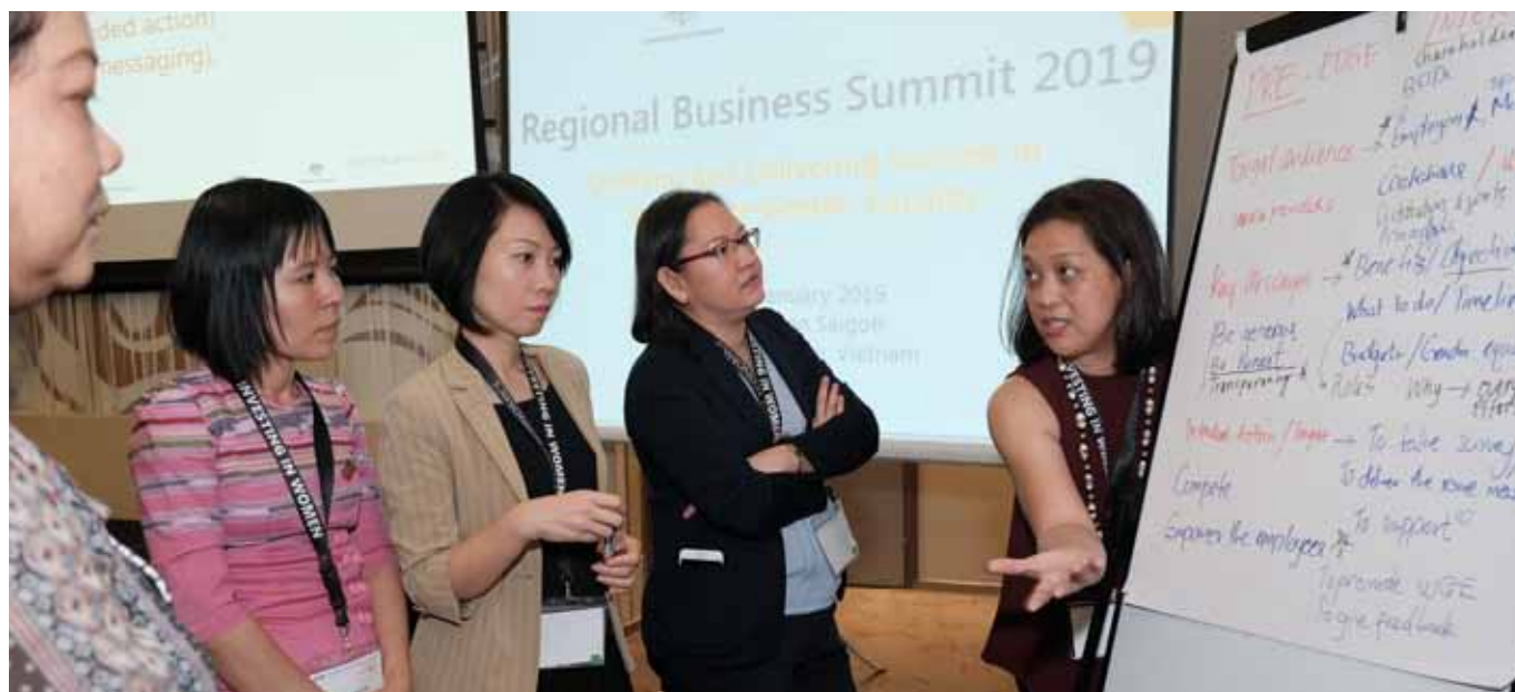
Participants work over strategies at the Investing in Women 2019 Regional Business Summit on Gender Equality, held at Ho Chi Minh City for business leaders and human resource specialists from around Southeast Asia. Having an entrepreneurial mindset is critical to women's business success.

Scaling-up of SMEs may take place after the start-up phase, but can also occur at other points in a firm's life. A company might scale up in response to a major increase in demand, to bolster its competitive position, or to seize new market opportunities.