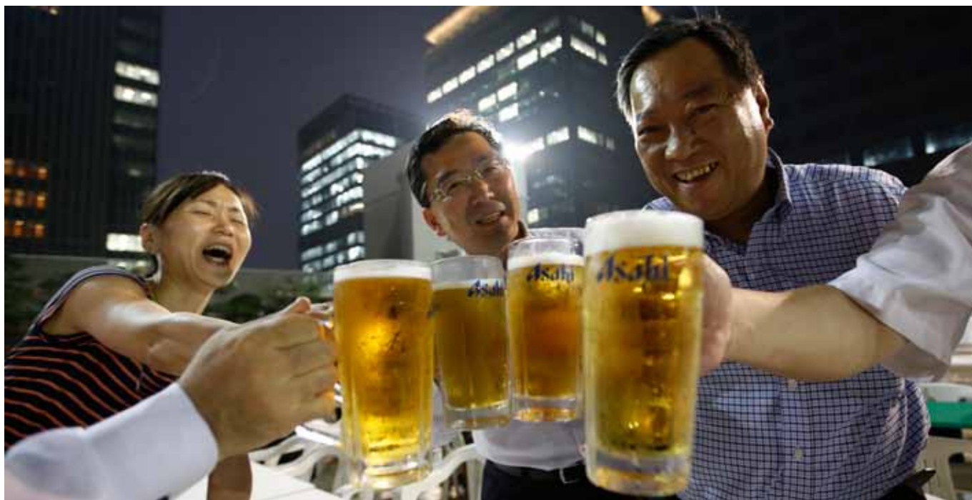
Business colleagues raise an after-work glass at a beer garden in Tokyo. Women who endeavour to compete on an equal footing with men generally feel pressure to adopt the working style expected of their male counterparts.