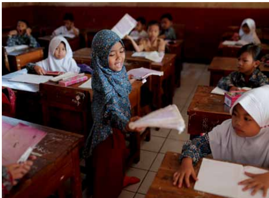
Students in class at a school in Cikawao village, Majalaya, in Indonesia's West Java province. Indonesian courts tend to hand down heavy sentences for sexual misconduct by teachers.

The United Nations defines sexual harassment as unwelcome behaviour of a sexual nature. It can take the form of an unwelcome sexual advance, a request for sexual favour, verbal or physical conduct or a gesture of a sexual nature, or any other behaviour of a sexual nature that might reasonably be expected or be perceived to cause offence or humiliation to another.