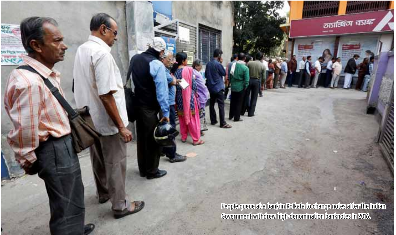
People queue at a bank in Kolkata to change notes after the Indian Government withdrew high-denomination banknotes in 2016.

Muslims, who make up close to 15 per cent of the population (190 million people), are increasingly pushed into enclaves. There have been attacks on people—usually Muslims, but sometimes Dalits (formerly Untouchables)—who have been portrayed as killers of cows or insufficiently enthusiastic about RSS-style ‘patriotism’. US intelligence recently repeated assertions, widely discussed in India, that Hindu-chauvinist organisations may ratchet up tensions before the elections to try to consolidate a ‘Hindu vote’.