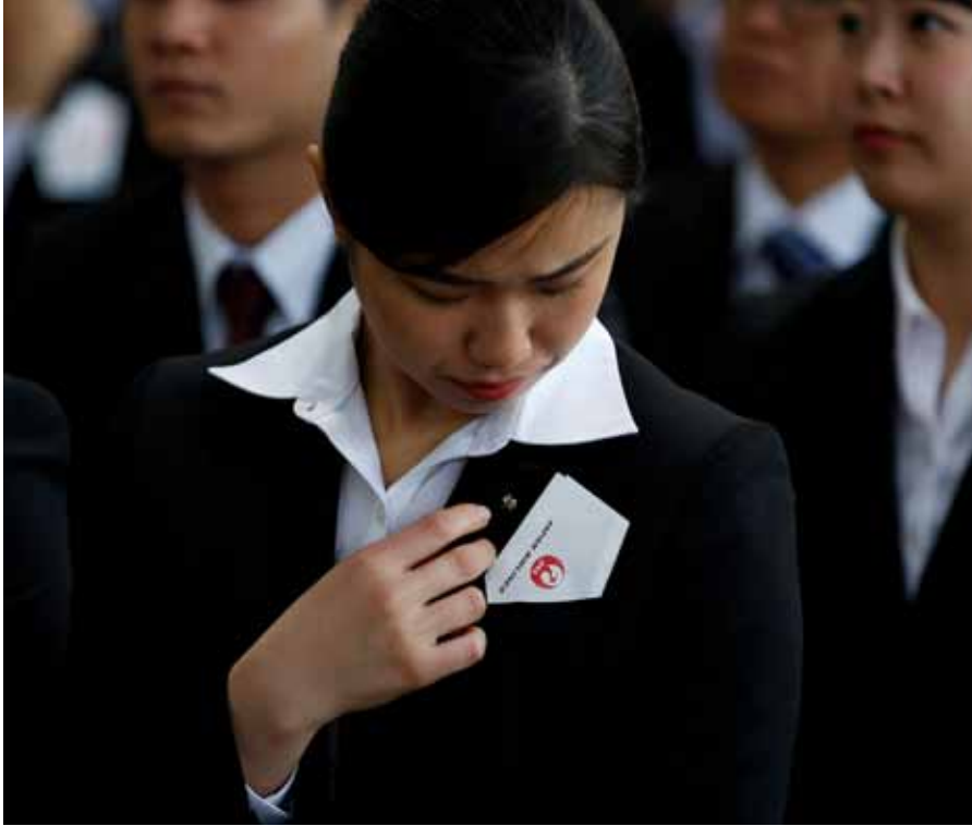
A new Japan Airlines employee checks her uniform at the company initiation ceremony in Tokyo. The number of women in non-regular employment is one reason for Japan's gender wage gap.

of women managers after 2013 when 'womenomics' policies were introduced, the gap remains large.