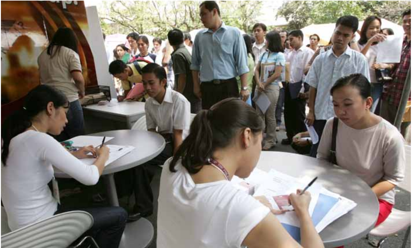
Filipinos being interviewed at a jobs fair for outsourced work in Manila. Women-friendly initiatives can improve female employees' commitment to the firm.

practices should lead to greater gender diversity at various departments and multiple levels of the organisation. These practices demonstrate the value an organisation places on the contribution of its female employees as they are potentially rewarded with more opportunities to increase their pay and human capital. In turn, female employees should reciprocate with greater commitment to their employer.