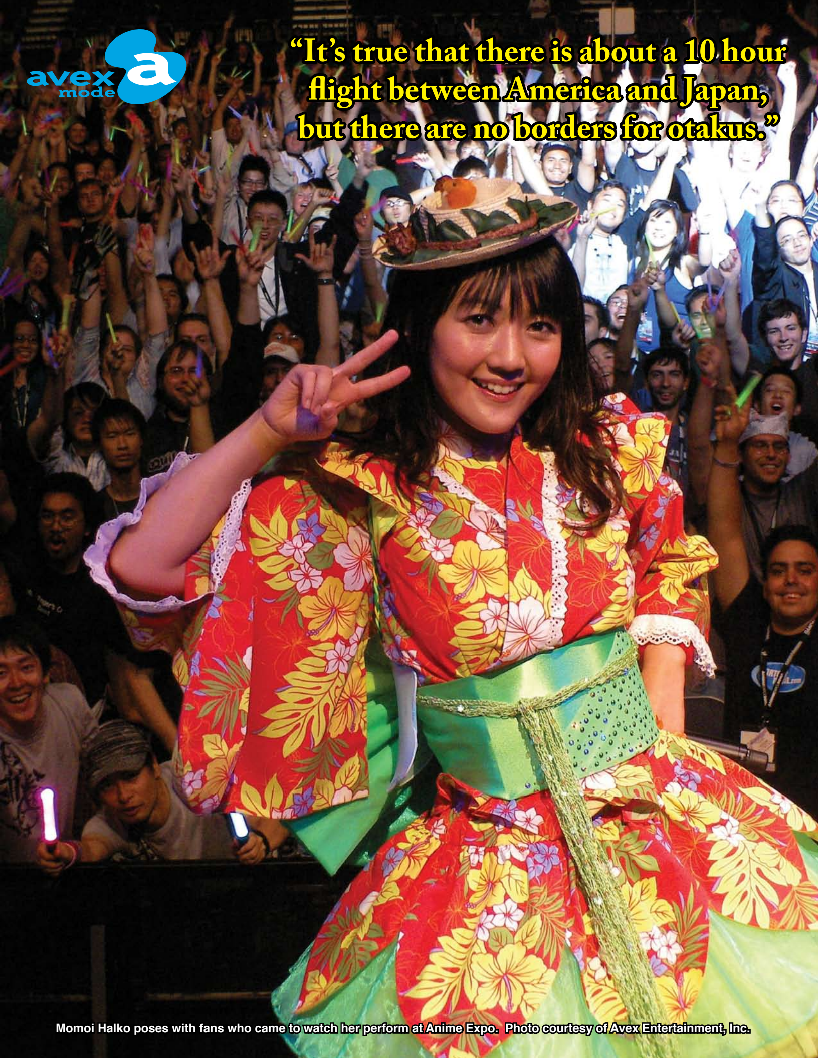
Momoi Halko poses with fans who came to watch her perform at Anime Expo.

“It’s true that there is about a 10 hour flight between America and Japan, but there are no borders for otakus.”