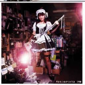
桃井はるこ さいごのろっく [はるこUP DATE] OP曲

●DVD収録内容 「さいごのろっく」PV映像 「はるこUP DATE」ダイジェストバージョン [DVD] ¥1,290 (税込) AVCA-2801 (B/B) [CD] ¥1,290 (税込) AVCA-2801 B