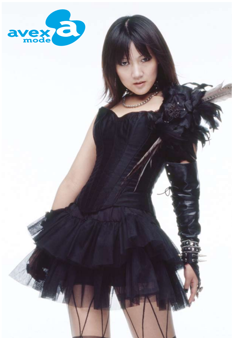
Halko Momoi sporting a black outfit (darkside) from her “Best of Momoi” album “Momo-i Quality”.

As documented on her recent drama series based on her life “HALKO★UP DATE - Halko Momoi Story”,