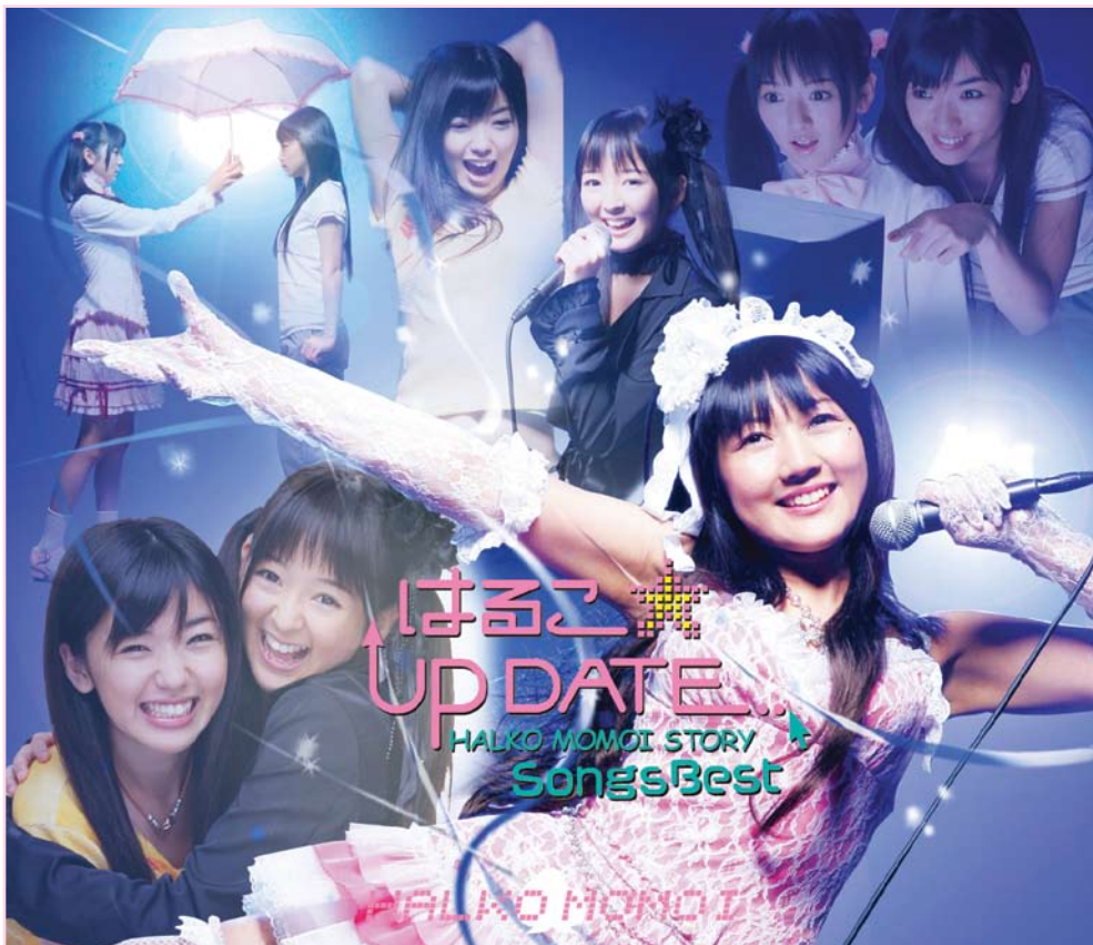
PHOTO: Momoi cosplaying a sailor outfit for her CD single "Yume no Baton"(image is of the normal CD version) and an image of her "Haruko*UP DATE - Halko Momoi Story - Songs Best".