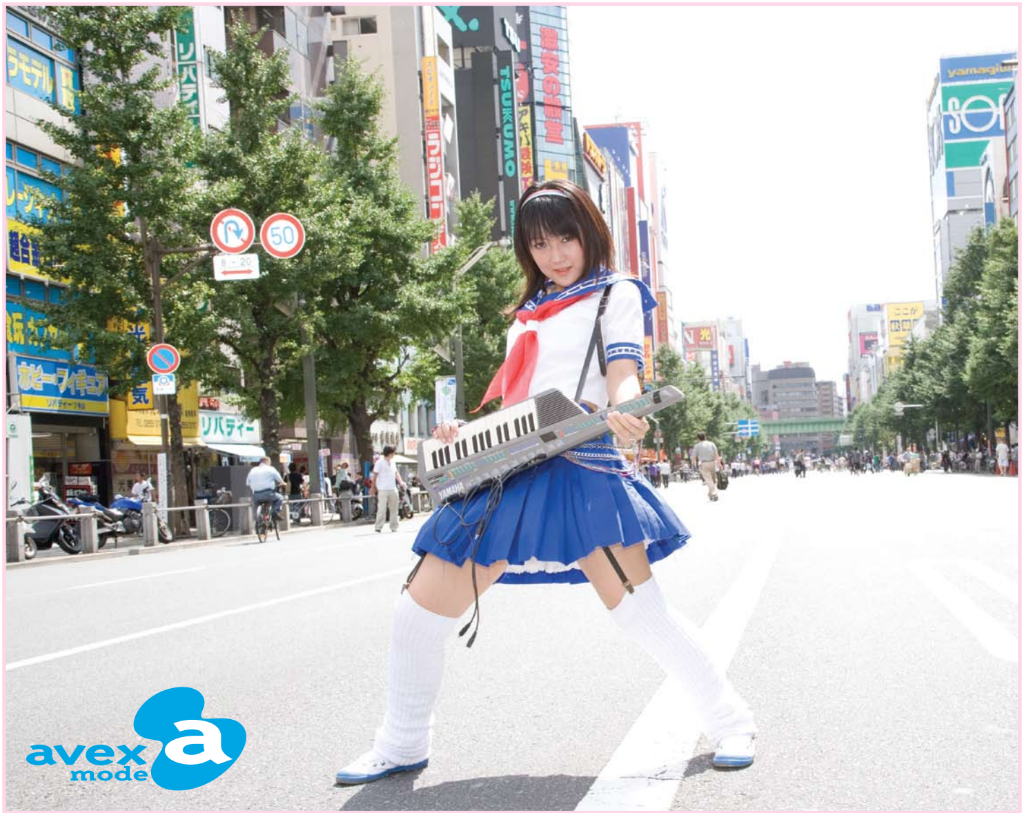
Introducing Akihabara's super idol - Momoi Halko.

With her seiyuu career flourishing, Momoi still loved performing live and continued this by being part of a unique music group.