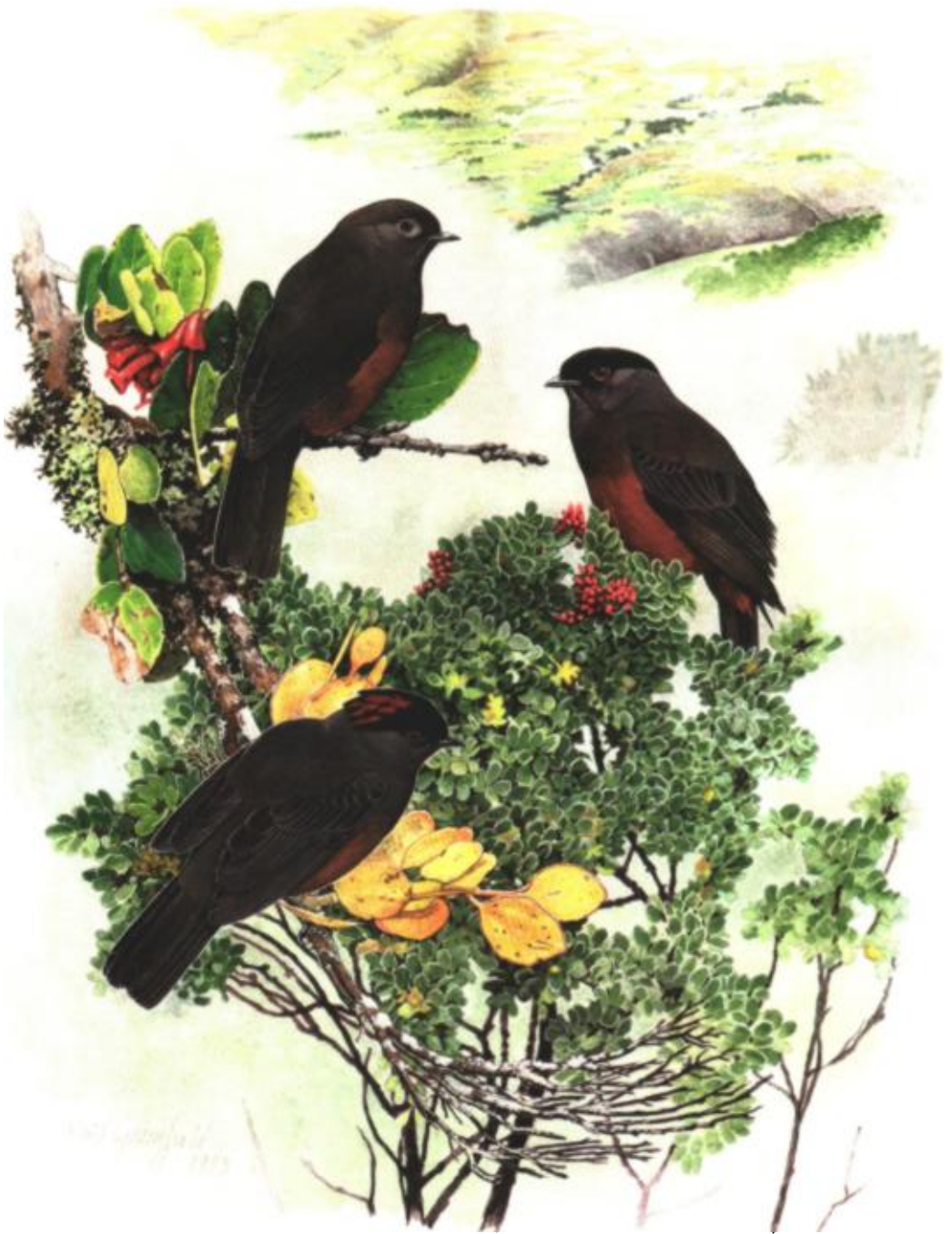
Frontispiece. Male (upper right and below) and female (upper left) Chestnut-bellied Cotinga ( Doliornis remseni sp. nov.). Upper male perched in Escallonia myrtilloides (Saxifragaceae). Painting by Paul Greenfield.