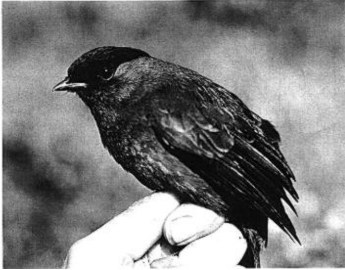
Fig. 2. Adult male Doliornis remseni (ANSP 185684; VIREO r08/16/001-2) from Ecuador/Peru border, 28 October 1992.

acquisition of adult plumage is exhibited in A. rubrocristatus . Data for 62 specimens (59 LSUMZ, 3 ANSP) with skull-ossification data were tabulated: 34 in adult plumage with 100% ossified skulls; 11 in adult plumage with incomplete ossification (4, 90%; 5, 75%; 1, 60%; 1, 50%); 6 in subadult plumage (1, 50%; 1, 40%; 1, 25%; 1, 20%; 2, 0%); and 2 in juvenal plumage (1, 10%; 1, 0%). Five of the 11 specimens in adult plumage with incomplete skull ossifications were in breeding condition.