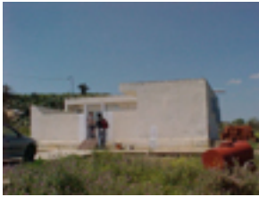
Utica. Site office prepared by INP. Meeting room, washrooms, kitchenette.