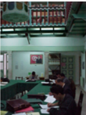
Institut National du Patrimoine, library.