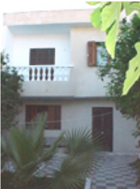
Raf Raf Rented house for trainers and GCI staff, GCI's quarters.