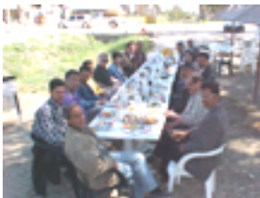
Utica. Trainees, trainers, organizers.

that must be purchased with convertible currencies. Therefore, having his staff trained in foreign countries where they are taught how to do conservation in the most appropriate way, by using products and equipment that are not available to them in their country, is of very limited use.