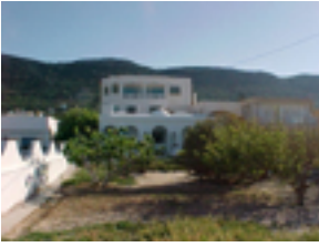
Raf Raf. Rented house for trainers and GCI staff, trainers quarters.

Those concerned with the conservation of historic towns in North Africa could greatly benefit from research and development that would help them work with public works authorities to integrate new amenities in a way that is compatible with this sensitive environment. Furthermore, important foundation damproofing and restoration work could be programmed and funded in conjunction with major public infrastructure works.