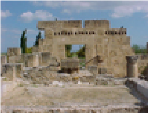
Utica, Maison de la cascade, main entrance.