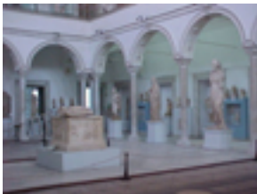
Figure 1 Statuary from Roman period. Museum curators are searching for appropriate cleaning techniques.