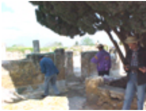
Utica. Trainees at work on site.