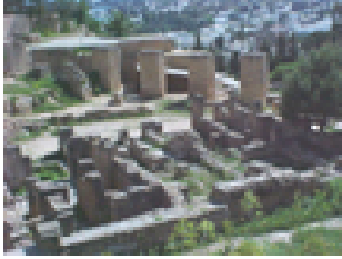
Carthage. What message and how it is presented to visitors needs development.