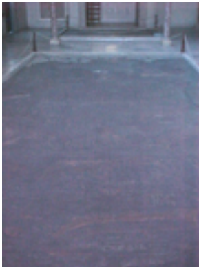
Bardo Museum. Mosaic protected by wax. Details and colors are no longer visible due to wax and dust accumulations.