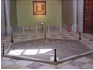
Bardo Museum. Deposited Mosaic. Dust accumulation problem, cleaning once a week by specialized staff.