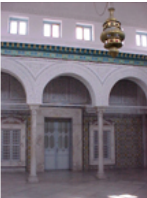
Institut National du Patrimoine, interior courtyard.