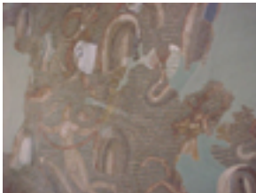
Bardo Museum. Mosaic collection for which training of curators is required.