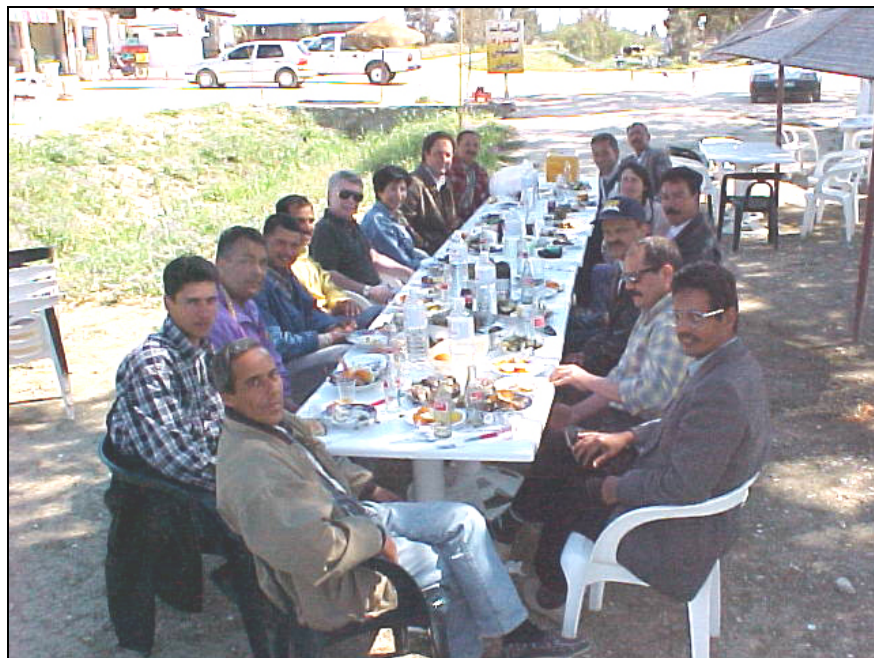
Mosaics 2001 First Campaign: Trainees, trainers, organizers

There are no telephone and Internet connections. The use of a cellular phone has made a positive contribution. Should we acquire a roaming telephone number for the Internet, this would also facilitate communications.