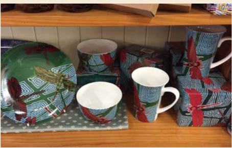
Alperstein Designs cups and plates.

"William the Wild goes camping" features lovely illustrations of local fauna in their natural environments, by WA Artist Leanne White. The text is easy to read with melodic rhyming rhythm. $14.95 each.