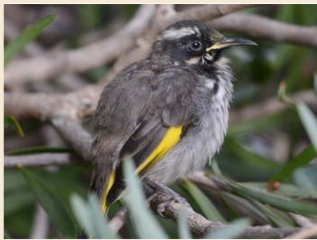
A young Honeyeater, fluffed up to stay warm.

We were privileged to have the New Holland Honeyeaters nesting in our tubestock area this spring. It was very cute to see the young babies hatch out. These birds are very common and getting more used to living close to humans. Provide plants for food and shelter and you will be sure to have them zooming around your garden.