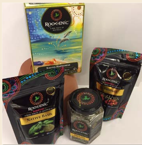
Roogenic Herbs and Herbal Teas