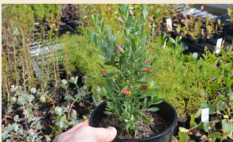
Eremophila 'Pink Passion'

• These acacia cuttings are now ready for potting - 8 months from starting. Of course others are faster, scaevola can be ready in eight weeks in summer, these are the ones to try at home if you want to have a play at cuttings.