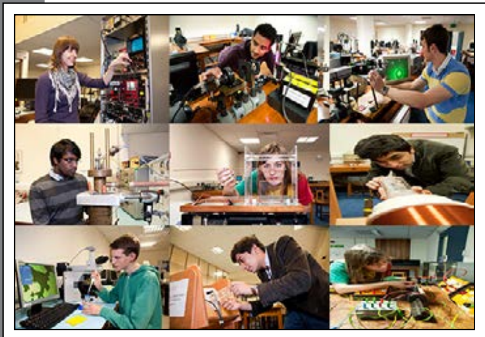
Undergraduate Laboratory Images