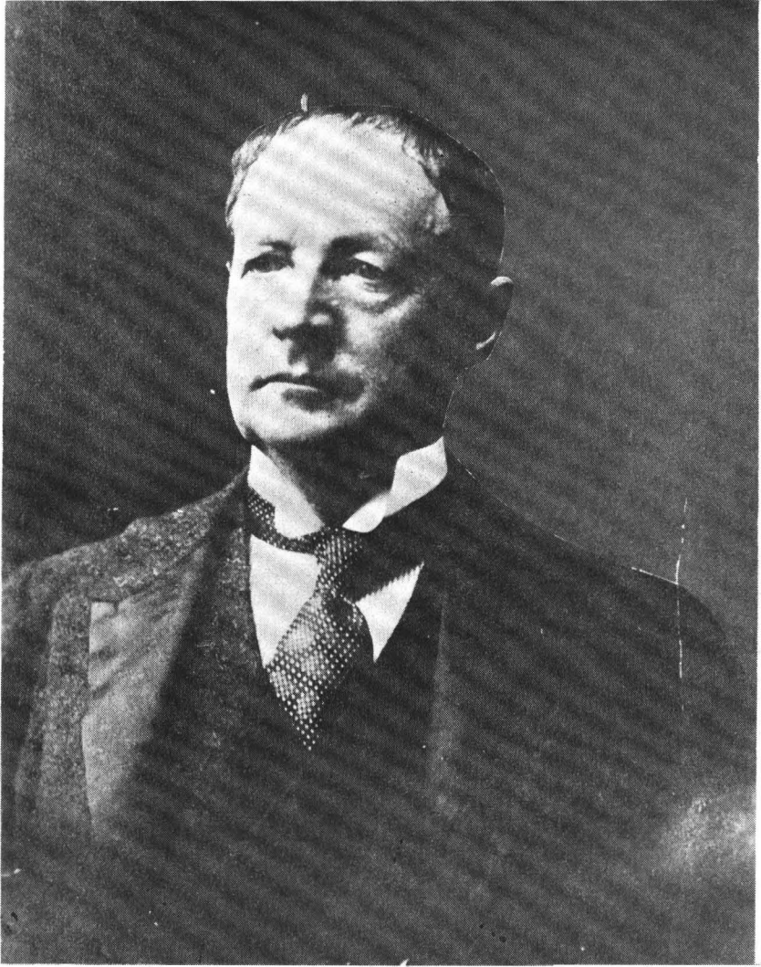
Francis G. Newlands