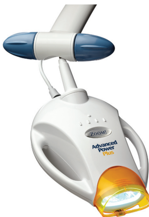
Zoom uses a bulb with a mix of ultraviolet (UV) and visible light to enhance the penetration of the whitening gel into teeth enamel

market, ACP, has been beneficial in decreasing sensitivity through a variety of actions. 16 Tooth enamel is composed almost entirely (96 percent by weight) of a calcium phosphate mineral in the form of carbonated hydroxyapatite. Dentin is 70 percent by weight composed of hydroxyapatite. ACP then rapidly hydrolyzes to form hydroxyapatite within five minutes of application. If fluoride is present, a more acid resistant compound, fluor-apatite is formed. ACP also precipitates on the surface and within the lumens of open dentinal tubules to occlude them, resulting in decreased sensitivity. 17 This also makes the exposed dentin more resistant to demineralization by acids.