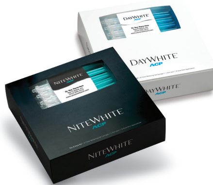
Zoom NiteWhite and Zoom DayWhite by Philips