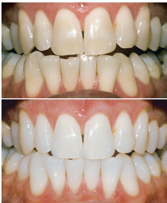
Clearly, whitening will provide a tangible improvement in tooth color.

In March 2008, the Standards for Clinical Dental Hygiene Practice were adopted by the Board of Trustees of the American Dental Hygienists' Association. The two stated purposes for this document are (1) "to assist dental hygiene clinicians in the provider-patient relationship" and (2) "to educate other health care providers, policy makers and the public about the clinical practice of dental hygiene." To access the full standards document, go to www.adha.org/downloads/adha_standards08.pdf . The following article on professional tooth whitening contains references that link back to the standards document. Readers who would like greater understanding of the standards are encouraged to read it alongside a copy of the standards document and make their own links to the information in the article. Readers who do so are encouraged to share their insights with Access.