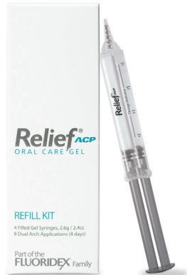
Relief® ACP Oral Care Gel

p6 Dental Hygiene Process of Care p6 Standard 1. I. a.