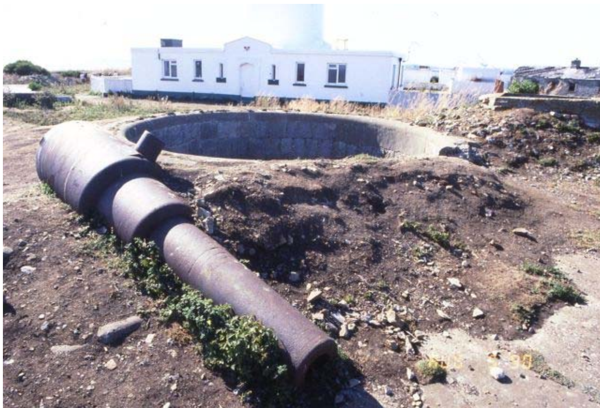
Light House Battery