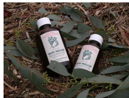
Photo: Eucalyptus Oil Bottles

A typical early eucalyptus oil operation involved a distiller, a bush boss and up to a dozen cutters and hands. Although it was a healthier job than working in the mines, cutting eucalyptus leaves by hand is hard work. Cutters have their backs bent all day, the tools were sharp, hand injuries were common and operating the distillery itself was hot, dirty and often dangerous. In the early years, cutters were mainly transients, most working for several distillers and sometimes in teams. Cutters got to know the bush intimately and named many individual trees, small rises and tiny gullies.