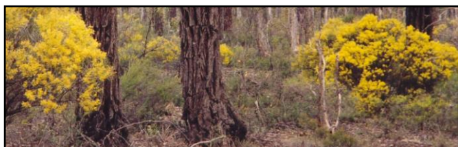
Photo: Red Ironbark and Whirakee Wattle in the Wellsford State Forest

Located just 15 km north east of Bendigo, the Wellsford State Forest is a great spot to relax, participate in a recreational pursuit or explore the history of the area. Bendigo is literally surrounded by forests and woodlands which boast a diverse array of plants and animals as well as Indigenous and European cultural heritage sites. Evidence of the region's rich history remains throughout the forest today.