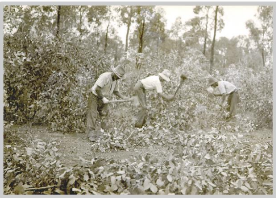
Photo: A hard day's work cutting the leaves for the Wellsford eucalyptus distillery.

The earliest method of gathering leaves to distill eucalyptus oil involved men harvesting trees with axes and stripping the leaves and terminal branches. The timber was used for sawlogs, residual logs (for building), fencing timbers and firewood, while the leaves went to distilleries.