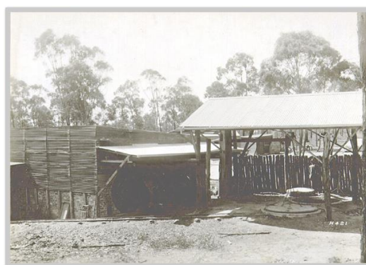
Above: The Wellsford eucalyptus distillery plant. On the right are the vats for steaming the leaves. On the left is the boiler for raising steam. The plant produced about one ton of oil per week.

The distillery that once operated on this site was established in 1926 and managed by the Forests Commission for 25 years. The aim was "to investigate the conditions of the industry in general, the best timber and time to cut the leaves, the best yields at various seasons, and the most economical means of operating and marketing". The existence of the government-owned distillery caused much angst in the industry, which considered the government was cutting into their markets.