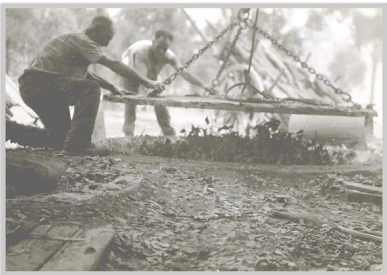
Photo: Leaves are packed tightly and steamed to release the eucalyptus oil. The oil is cooled in the condenser.

The Wellsford distillery had two vats about three metres in diameter and four metres deep. These were dug into the ground and lined with bricks. There was also a boiler (rescued from a closed mine in the region), a dam, crane to lift heavy lids off vats and a cart to take ash away. Can you piece together the remnants from this former distillery? The site where the ash was deposited remains bare of vegetation. Can you find this?