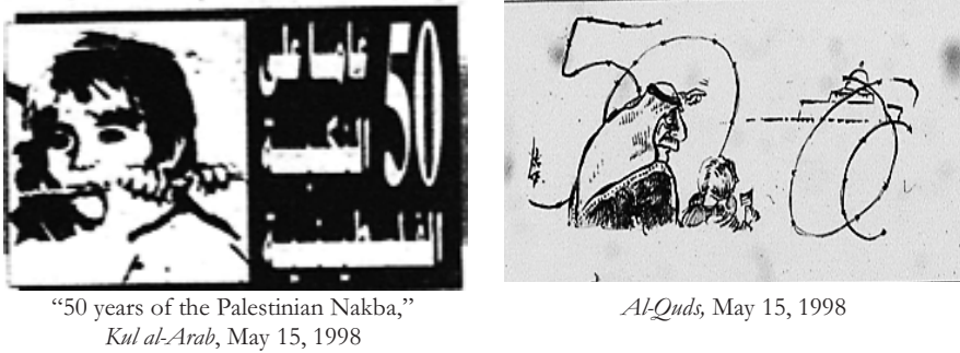
"50 years of the Palestinian Nakba," Kul al-Arab , May 15, 1998