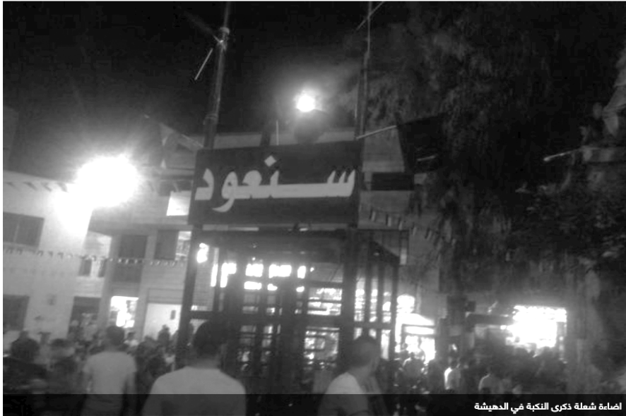
“We will return.” Al-Quds Online , May 14, 2016.

Mahmoud Abbas in 2008, characterizes “the permanent Nakba,” 101 land confiscation is deemed the principal defiance of international law and of “individual and collective [Palestinian] rights.” 102 In response to the maintenance of settlement activity in the West Bank and East Jerusalem in line with Netanyahu’s 1997 ‘Allon Plus Plan’ 103 and the concurrent implementation of a secret plan by the Israeli Civil Administration to dedicate ten percent of the West Bank to further settlements, 104 annual Nakba mediation since the mid-90s has consistently proclaimed “the destruction of the two-state solution.” 105 Deriving from “Zionist colonial aggression,” 106 the destruction of the peace process is principally characterized by the “continuation of the settlement policy,” 107 “the Judaization of East Jerusalem,” 108 and, since 2003, “the racist separation wall.” 109