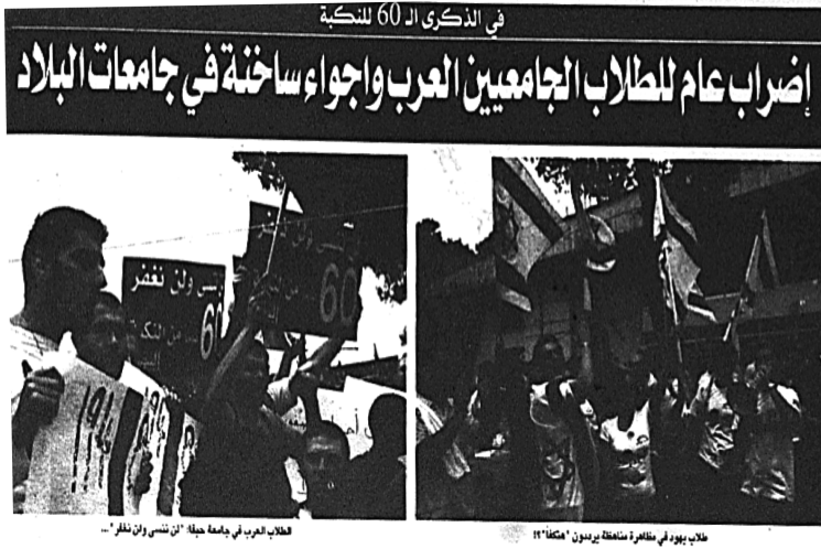
On the 60 th anniversary of the Nakba. General strikes among Arab student groups create high tensions in the country's universities. Kul al-Arab , May 16, 2008.