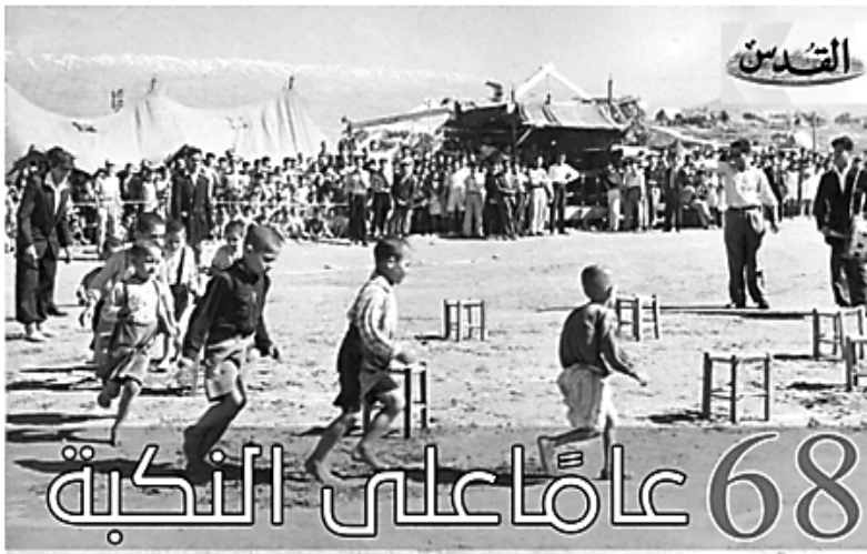
"68 years of the Nakba," Al-Quds Online , May 15, 2016.