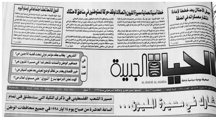
"Let's participate in the March of the Millions," Al-Hayat al-Jadida , May 13, 1998.