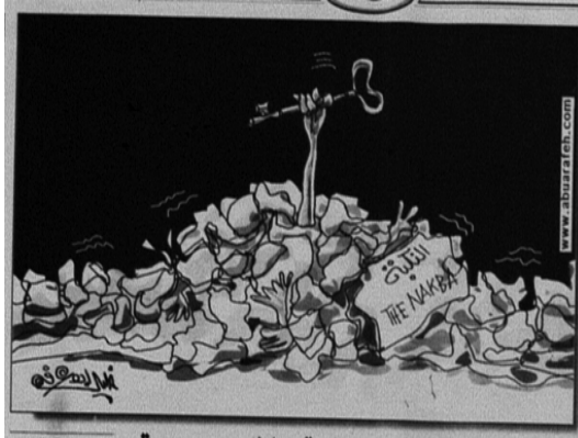
Al-Quds , May 14, 2001.