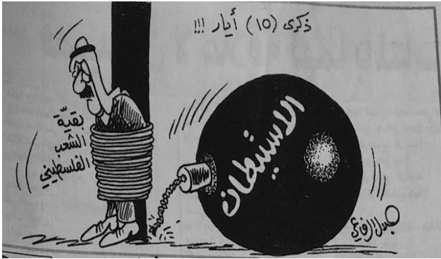
Figure 1.3. Holding on to the ‘national goals’

“The remaining Palestinian people [held captive by] settlements.” al-Hayat al-Jadida , May 14, 1998