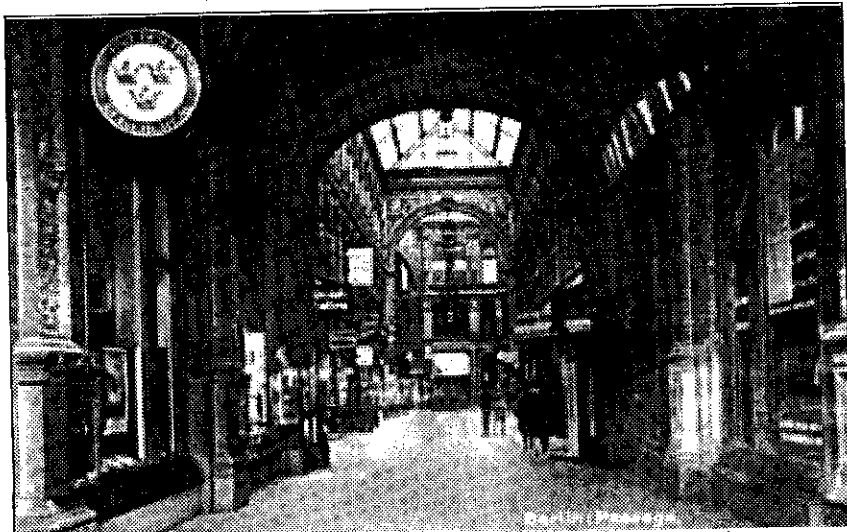
The Passage in Frierichstrasse in Berlin, where hustlers met their clients.

Needless to say, Graff eventually gives in to his passion, only to suffer horribly for it when Gunther disappears. Not the least of his torments is not being able to share his loss, something most gay