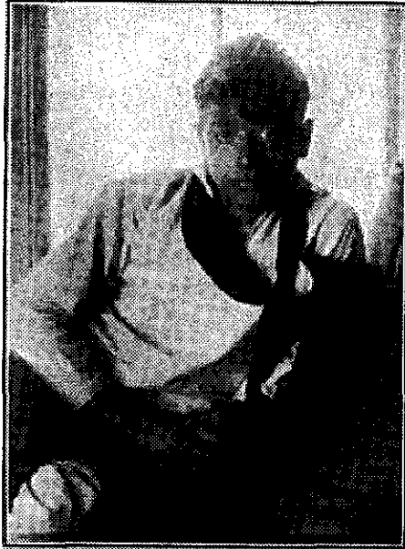
JOHN HENRY MACKAY