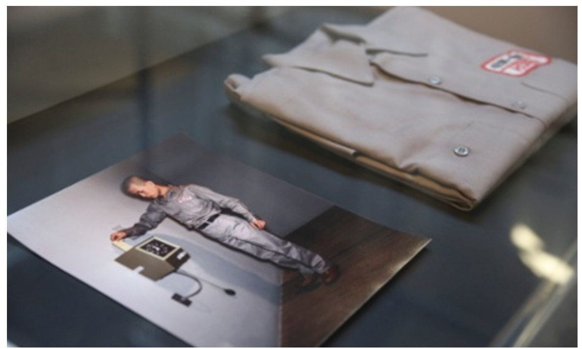
The Time Piece uniform.

The work was one of five that Hsieh, now 65, created in the late 1970s and early 1980s; works which, while known and appreciated in the niche world of performance art, have only achieved wider recognition over the past five years.