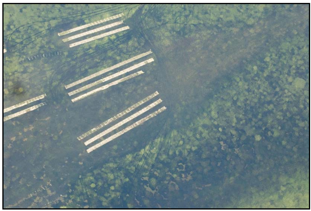
Extensive outboard motor cuts in the eelgrass. Image taken 5/6/2007.

Dense assemblages of oysters may reduce recruitment of other species with a planktonic larval stage and reduce plankton in the water column by filter-feeding. This feeding limits the amount of food available to native bivalves and ostracods. Clam abundance is reduced under oyster racks, possibly due to changes in bottom sediment grain-size, particulate organics that contribute to higher sulfide levels, or increased predation by fish and decapod crustaceans attracted to the oyster racks. In other parts of Drakes Estero, clams can be found in extremely high densities - up to 250 per square meter.