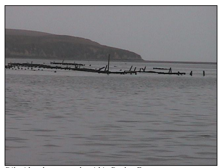
Dilapidated oyster racks within Drakes Estero.

Disturbance and displacment of wildlife by oyster farming activities have been documented at Drakes Estero and elsewhere. Kelly et al. (1996) documented how oyster racks influenced shorebird use of tidal flats in Tomales Bay by enhancing feeding opportunities and food for some species, such as gulls and willets, while decreasing them for others, such as the dunlin. Additionally, the bags create an anoxic dead zone underneath by smothering native infauna and trapping sediment; consequently, there is less food available in the mud for birds to feed on. Currently, there are thousands of oyster bags on mudflats in Drakes Estero throughout the estero, and the number of shorebird species and their distributuion may be affected.