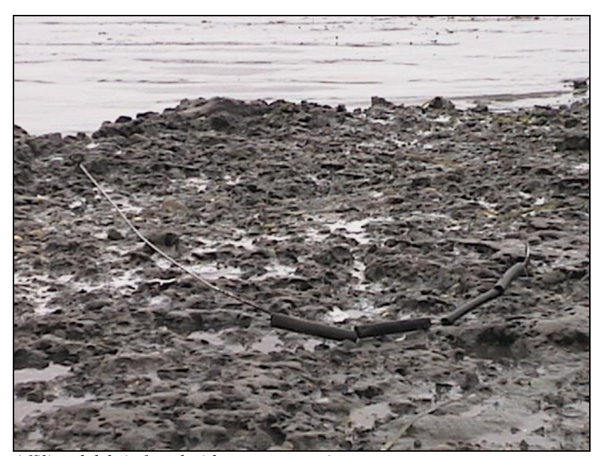
Affiliated debris found with oyster operations.