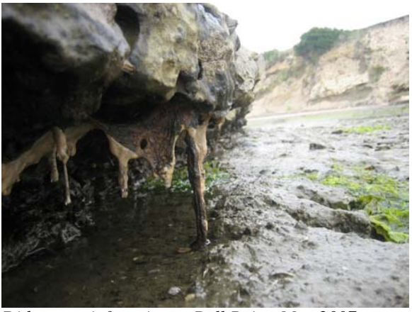
Didemnum infestation at Bull Point, May 2007.

Most of the apparently older and larger oysters growing on racks had extensive non-native, highly invasive tunicates ( Didemnum Species A) growing on them (See images). This species is an aggressive invader that has had substantial ecosystem and financial impacts in New Zealand, several west coast estuaries and the Grand Banks off Newfoundland. Other fouling organisms (native and non-native sponges, tunicates, bryozoans, and mussels) were observed on both oysters and racks throughout the estuary.