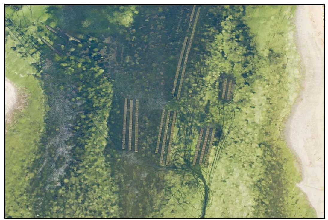
Extensive outboard motor cuts in the eelgrass. Image taken 5/6/2007.

Most of the apparently older and larger oysters growing on racks had extensive non-native, highly invasive tunicates ( Didemnum Species A) growing on them (See images). This species is an aggressive invader that has had substantial ecosystem and financial impacts in New Zealand, several west coast estuaries and the Grand Banks off Newfoundland. Other fouling organisms (native and non-native sponges, tunicates, bryozoans, and mussels) were observed on both oysters and racks throughout the estuary.