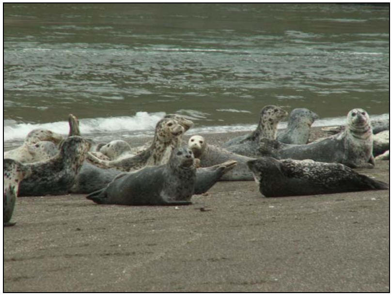
Harbor seals resting on mudflats.

the park implemented a seasonal closure to kayaks during the pupping season and because JOC was operating at a reduced level in the mid-1990s (Vanderhoof and Allen 2005). The pup count in 1986 was 255 compared with 464 in 2004, an 82% increase.