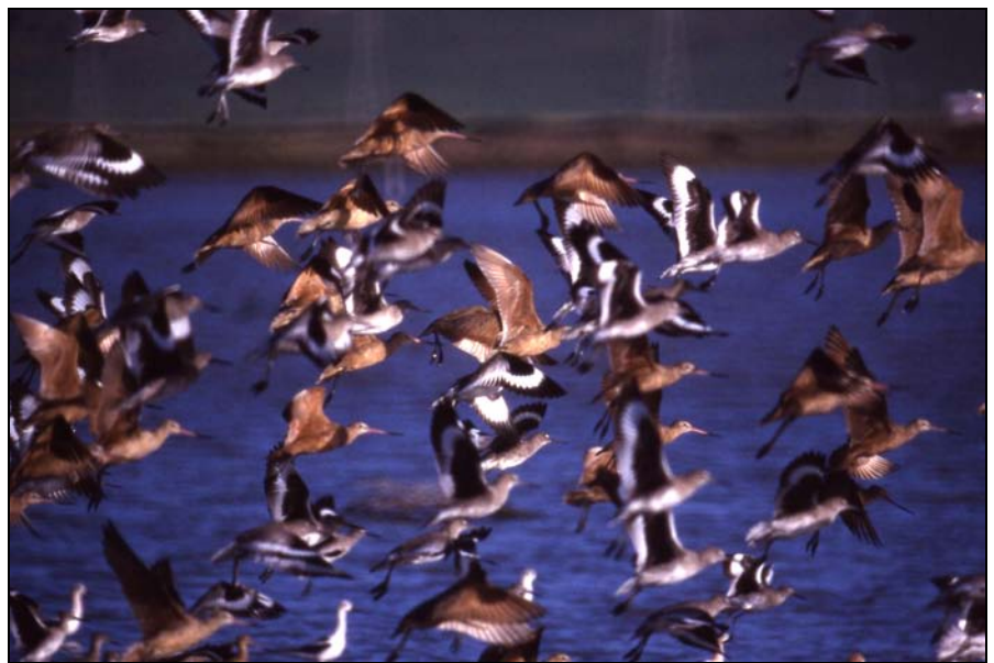
A flock of marbled godwits and willets. The waters and shoreline of the estuary provide a home to over a 100 species of birds.

The estero is one of only a few locations where thousands of Black Brant over-winter where they rest and feed on eelgrass (Shuford et al. 1989). "Brant is a holarctic species (it has populations in boreal regions all around the world) that nests on tundra near saltwater environments" (<a href="http://www.prbo.org/obs_cms">http://www.prbo.org/obs_cms</a>). They are on the Audubon species Watch List because of their sensitivity to habitat loss. From the summer through December, hundreds to thousands of Brown Pelicans, a federally protected species, congregate at the esteros, feeding on large schooling fish such as anchovies, herring and smelt, and resting on tidal mudflats. Other species that occur in large numbers are Caspian Terns, Gadwall, Ruddy Duck, American Widgeon, Bufflehead, and Green-winged Teal, Western and Least Sandpiper, Dunlin and Blackbellied Plover. In the past 15 years, an egret colony formed near the mouth of the estero where Snowy Egrets, Great Egrets, and Great Blue Herons nest. In the past, Snowy Plovers nested at the mouth of the estero, but have not since the late 1990s due to predation, changes in habitat and disturbance.