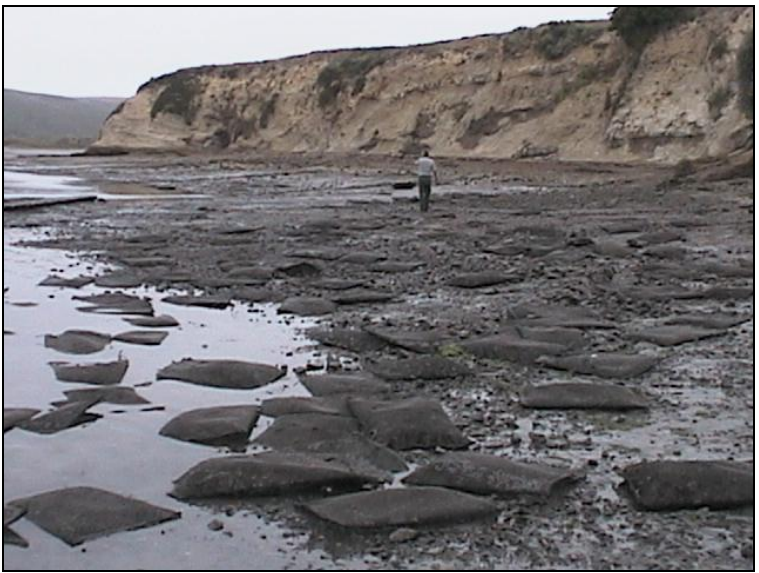
Oyster bags that cover the shoreline at Bull Point.

The activities of Johnson's Oyster Company (JOC) produced many adjudicated environmental problems. As a condition of a stipulated agreement (Marin County Superior Court No. 165361, March 1997), JOC was ordered to complete several actions, including obtaining building permits and upgrading facilities and septic systems to meet state and county code requirements. DBO is in the process of upgrading the facilities but is still under a Cease and Desist Order from the California Coastal Commission.