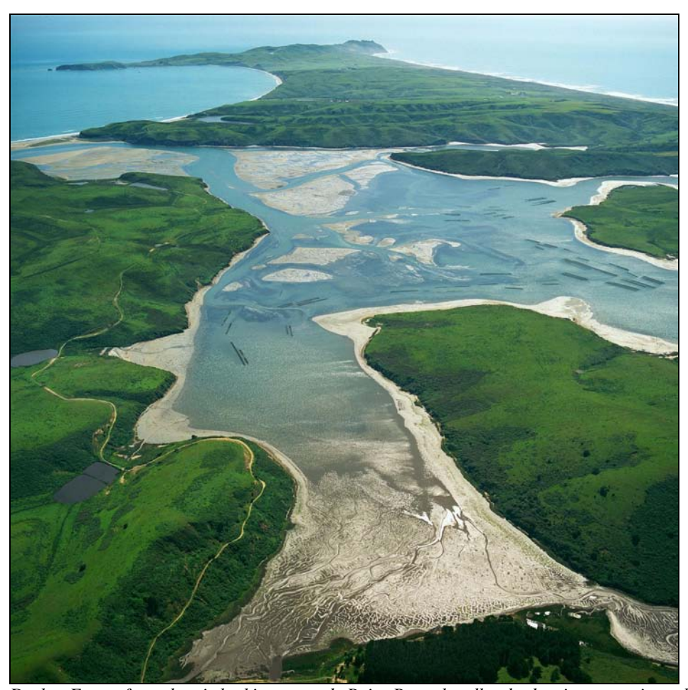
Drakes Estero from the air looking towards Point Reyes headlands showing extensive eel grass beds.

Tidal exchanges occur through a narrow inlet that is 21 feet deep. Tidal exchanges are cycled completely with a tidal bore that travels the length of the estero to Bull Point; however, exchanges are less complete in the fingers of the estero. The deepest point is 25 feet at the first bend along the major channel from the entrance. The tidal range is twelve feet from -6.0 to 6.6 feet with currents ranging between 32 cm/sec to 46 cm/sec (Anima 1990). Because the estuary is mostly shallow, the water column is well mixed from wind and tides, resulting in a mostly homogenous saline level. Salinity ranges measured in 1987-88 varied little between the upper and lower reaches of the estuary (33.67-34.356 ppt; Anima 1990).