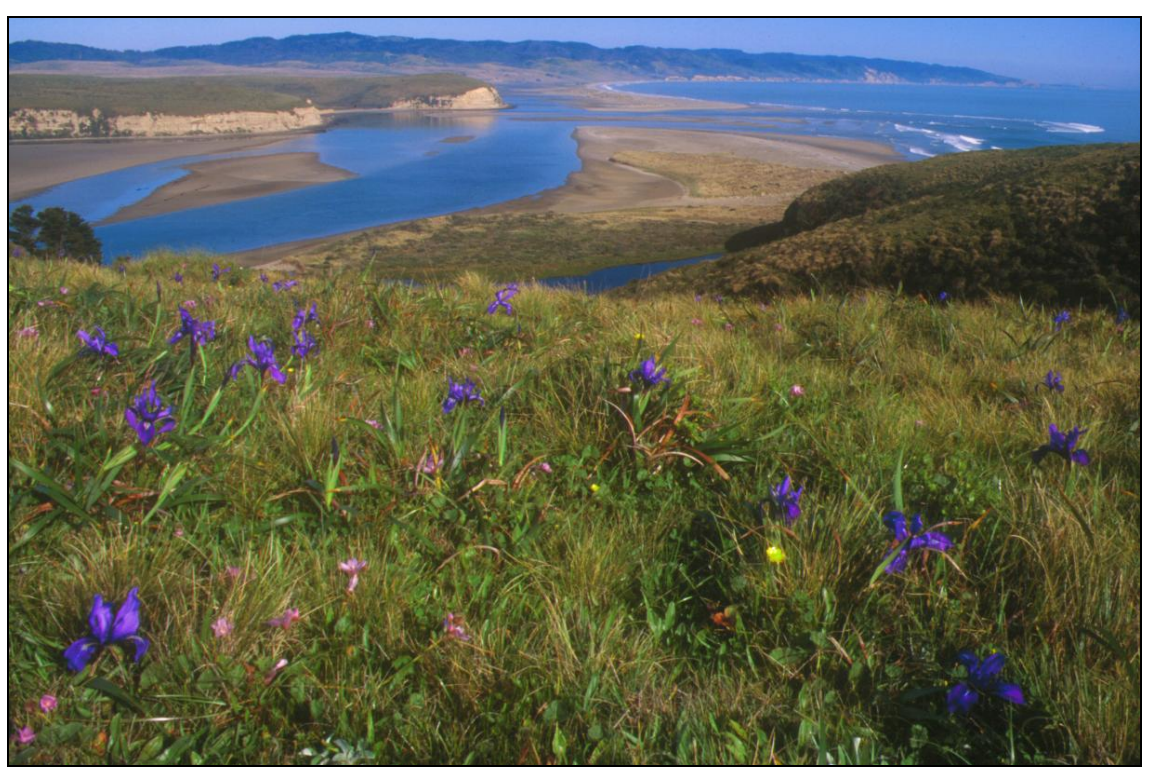
Douglas iris near the mouth of Drakes Estero.