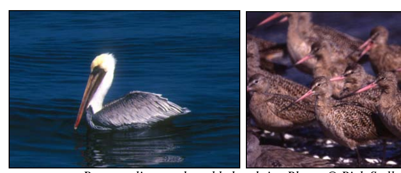
Brown pelican and marbled godwits.

The bird life in Drakes Estero and Estero de Limantour is highly diverse and abundant, and the esteros are recognized as significant sites for bird conservation. The Fish and Wildlife Service recognized Drakes Estero as a Western Hemisphere Shorebird Reserve and as significant for the conservation of shorebirds in the Southern Pacific Shorebird Conservation Plan. The maximum population of all shorebirds combined was estimated at between 10,000 and 100,000, and the estero regularly holds thousands of shorebirds in winter (Hickey et al. 2003; http://www.waterbirdconservation.org/). A similar designation is pending for waterbirds.