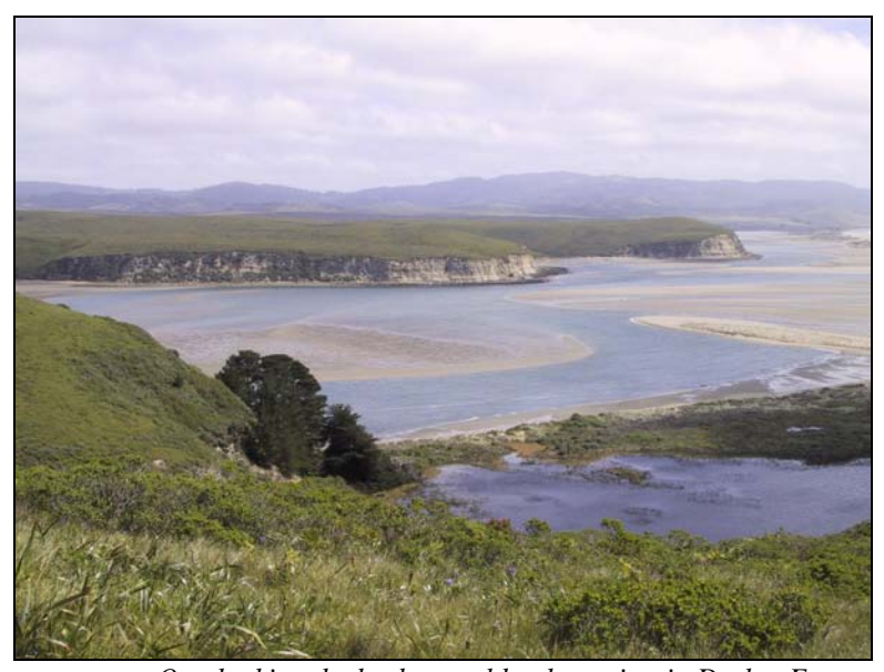
Overlooking the harbor seal haul out sites in Drakes Estero.

Drakes Estero is one of only 5 major seal colonies in Point Reyes and together represent around 20% of the state mainland population of harbor seals, the highest concentration in the state (Allen et al. 2004).