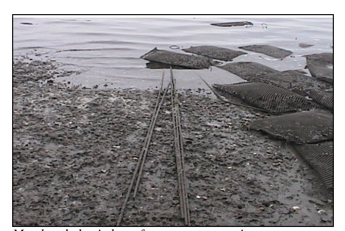
Metal and plastic bags from oyster operations.

The ecology of the estero is altered by changes in hydrology and sedimentation, which in turn change habitats and their associated species. Eelgrass beds, for example, in Estero de Limantour where there is no oyster farming, had higher densities of standing stock, as measured by the number of turions and blades, compared to Drakes Estero (AMS 2002). Eel grass is very sensitive to light, nutrients, pollution and sedimentation, and is thus an excellent indicator of estuarine health. Oyster farming reduces the amount of light available to eelgrass beds because of shading by racks, increases the amount of sedimentation due to deposition of oyster pseudo-feces and trapping sediment, and contributes pollution from treated construction materials and from general operations (trash). Researchers from Oregon State University found through experimental tests that both stake and rack culture (as practiced in Drakes