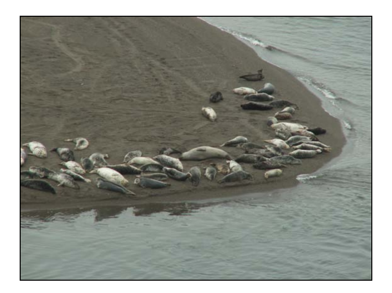
Harbor seals resting on sand bar.

One, invasive, non-native species found on oyster farming structures in Drakes Estero was the colonial tunicate ( Didemnum spp. ), a highly aggressive, invasive species that could alter Drakes Estero ecology. "In the Northwest Atlantic, a closely related species has covered 50-90% of the George's Bank. Such coverage can smother organisms living on the bottom and in the sediment, and block the settlement of larvae (http://www.sfei.org/). A small infestation of the species was also found on natural sandstone habitat at Bull Point in May of 2007. Removal of oyster racks in Drakes Estero would eliminate habitat for this invasive species.