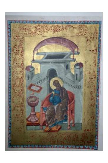
Fig. 2d) St. Evangelist John, fol. 235 v