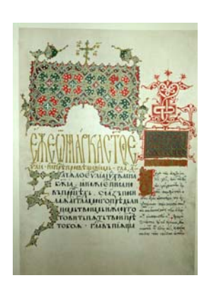
Fig. 1a) The first page of St Matthew's Gospel, fol. 7 r Gospel, fol. 90 r