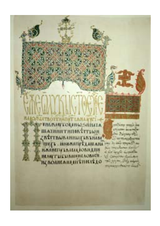
Fig. 1c) The first page of St Luke's Gospel, fol. 145 r John's Gospel, fol. 236 r