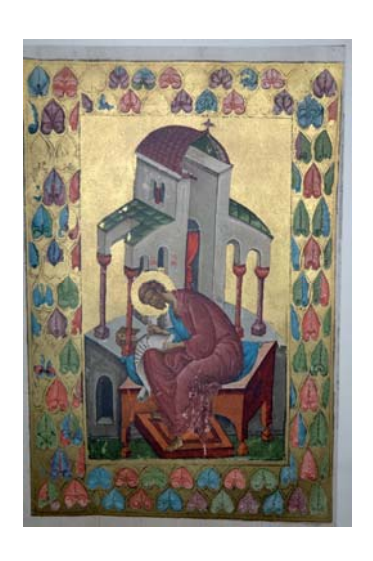
Fig. 2c) St. Evangelist Luke, fol. 144 v