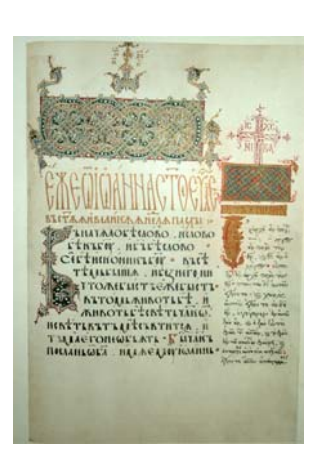
Fig. 1d) The first page of