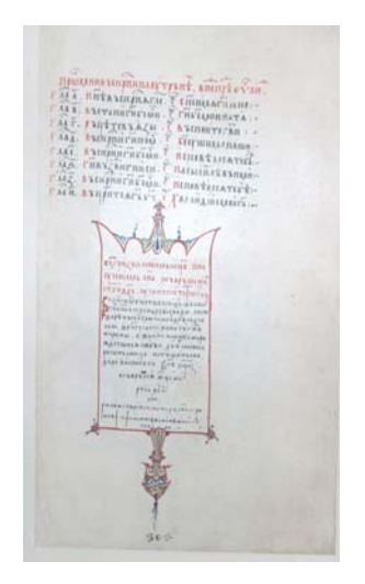
Fig. 3) Page with secondary ornamentation and initials Fig. 4) The last page of the manuscript with the colophon