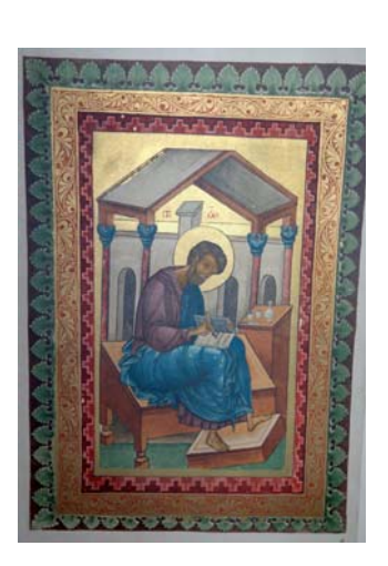
Fig. 2b) St. Evangelist Mark, fol. 89 v