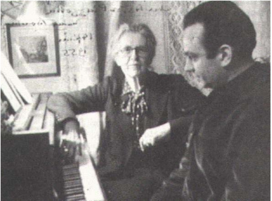
Astor Piazzolla with Nadia Boulanger, circa 1955

and New York. In his early years, he worked as bandoneonist in tango orchestras. A member of the accordion family, the bandoneon was brought to Argentina by German and Italian Immigrants, and it provided the signature sound for that internationally beloved Argentinian dance and music genre, the tango - much as the sound of the Cajun accordion marks Louisianian zydeco.