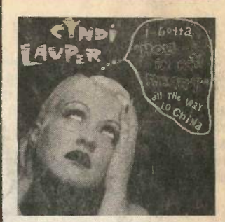
HOLE IN MY HEART Cyndi Lauper Epic - 34-07940-H