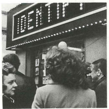
Electronically controlled sign out side Target Tape store in Toronto.

Target Tape, a downtown Toronto tape, records, component outlet, has unveiled a modern electronic computerized message centre, reported to be the first of its kind in Canada. The information centre has been designed to boost community programs and