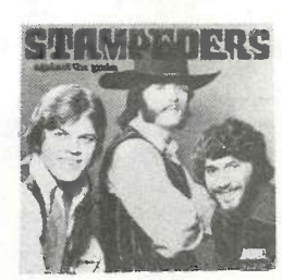
Against The Grain (MWC 701)

Available on 8 track tapes and cassette from