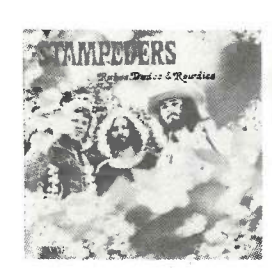
Rubes Dudes & Rowdies (MWC 704)