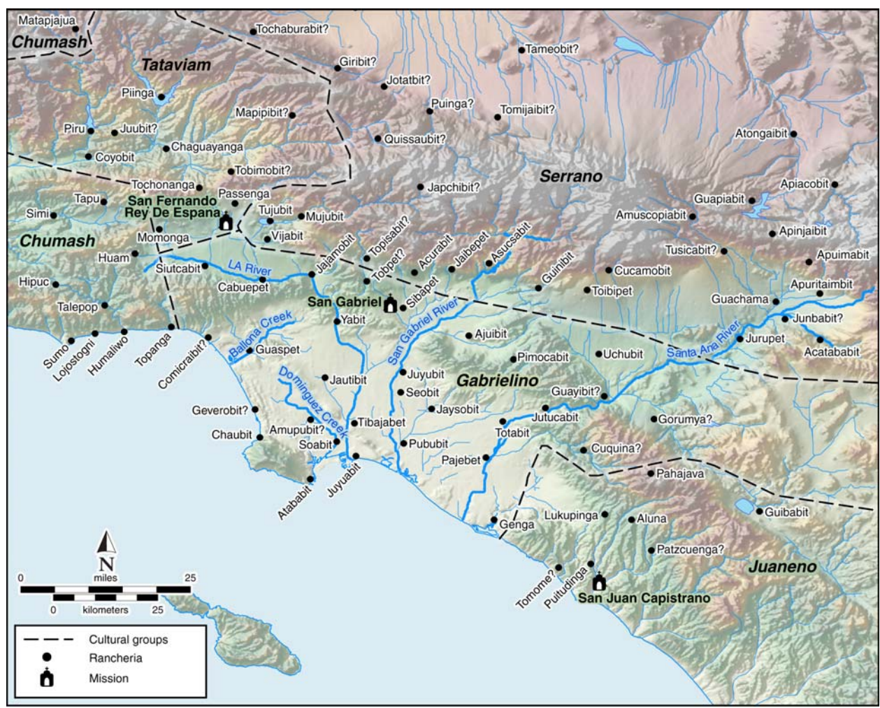
Figure 2. Approximate locations of Native American rancherias documented in mission records (rancheria locations and ethnic boundaries adapted from King 2004: Figure 2).

listed, which confirmed that child's origin in Guaspet. Connections between parents and other rancherias among what King calls the western Gabrielino place the rancheria in the general locality of the Ballona. Of note are names of spouses from the nearby rancherias of Comicraibit and Jautibit, located by King (2004:Figure 2) between the pueblo and Santa Monica Bay (see Figure 2). Somewhat later in time, marriage partners came from slightly more distant settlements, such as Pimubit, identified as Catalina Island, and Soabit, located near San Pedro.