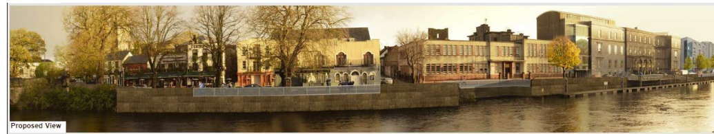
Example Montage of flood relief scheme at George's Quay showing wall with glass panel sections

There are two possibilities for the alignment of the embankment to the north-east (see Area A4 on the map). The Inner alignment is the emerging preferred option because it avoids construction within the SAC, and therefore the unknown timetable / success involved in taking the scheme to Stage 4 of Appropriate Assessment, which relies on proving Imperative Reasons of Overriding Public Interest (IROPI) and is largely untested through the planning system in Ireland.