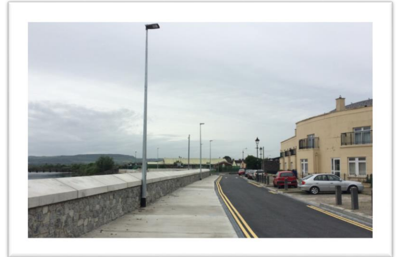
Verdant Place Advanced Works – Completed in August 2017