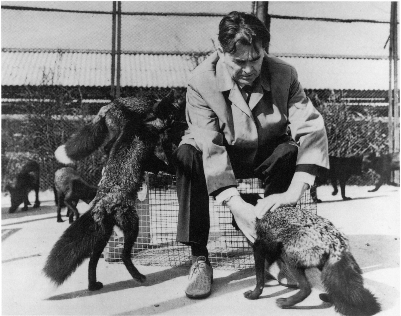
Figure 1. In the late 1950s, the Russian geneticist Dmitry K. Belyaev began a decades-long effort to breed a population of tame foxes. Belyaev, then director of the Institute of Cytology and Genetics of the U.S.S.R. (now Russian) Academy of Sciences in Novosibirsk, Siberia, hoped to show that physical and morphological changes in domestic animals such as dogs could have resulted from selection for a single behavioral trait, friendliness toward people. Fourteen years after his death, the experiment continues, and the results appear to support Belyaev's hypothesis.

that might well explain why different animals would respond in similar ways when subjected to the same kinds of selective pressures.