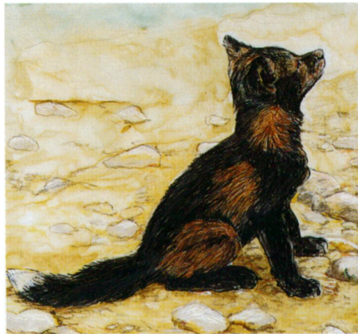
Figure 7. Changes in the foxes' coat color were the first novel traits noted, appearing in the eighth to tenth selected generations. The expression of the traits varied, following classical rules of genetics. In a fox homozygous for the Star gene, large areas of depigmentation similar to those in some dog breeds are seen ( top ). In addition some foxes displayed the brown mottling seen in some dogs, which appeared as a semirecessive trait.

tion. Fur farmers have tried for decades to breed foxes that would reproduce more often than annually, but all their attempts have failed.