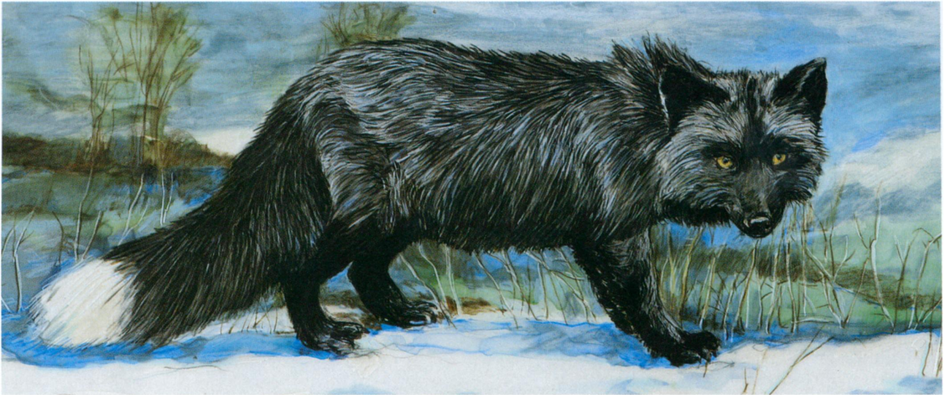
Figure 4. In typical silver foxes, such as those in the founding population of Belyaev's breeding experiment, ears are erect, the tail is low slung and the fur is silver-black, save for the tip of the tail. (All drawings of foxes were made from the author's photographs.)

tion, snarling fiercely at one another as they seek the favor of their human handler. Over the years several of our domesticated foxes have escaped from the fur farm for days. All of them eventually returned. Probably they would have been unable to survive in the wild.