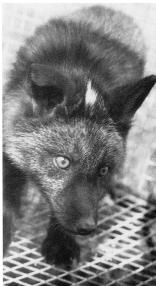
Figure 3. Piebald coat color is one of the most striking mutations among domestic animals. The pattern is seen frequently in dogs (border collie, top right), pigs, horses and cows. Belyaev's hypothesis predicted that a similar mutation he called Star , seen occasionally in farmed foxes, would occur with increasing frequency in foxes selected for tamability. The photograph above shows a fox in the selected population with the Star mutation.

At seven or eight months, when the foxes reach sexual maturity, they are scored for tameness and assigned to one of three classes. The least domesticated foxes, those that flee from experimenters or bite when stroked or handled, are assigned to Class III. (Even Class III foxes are tamer than the calmest farm-bred foxes. Among other things, they allow themselves to be hand fed.) Foxes in Class II let themselves be petted and handled but show no emotionally friendly response to experimenters. Foxes in Class I are friendly toward experimenters, wag-