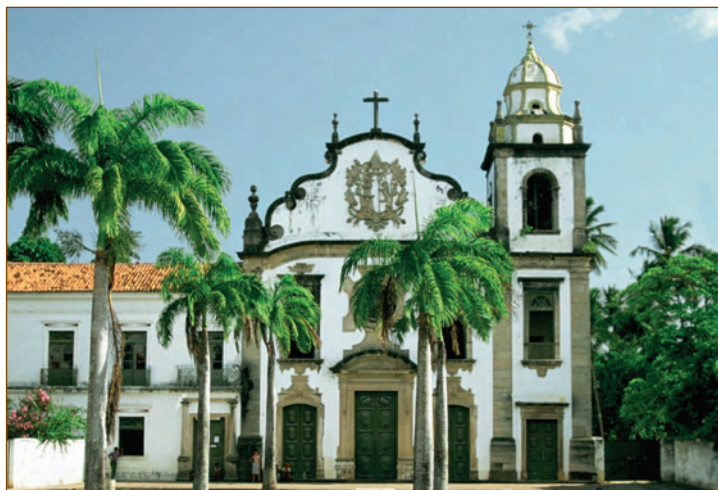
Facade of a church in Olinda, Brazil

While Portuguese is the official language, Spanish, English, French, German and Italian are important second languages for many in the country. Brazilian Portuguese is a variant of the language spoken