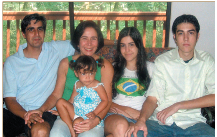
A Brazilian-American family at home in Sandy Springs, a place many Brazilians call home.

As the Portuguese began to develop this vast land, they established plantations. In order to meet the demand for labor, they imported