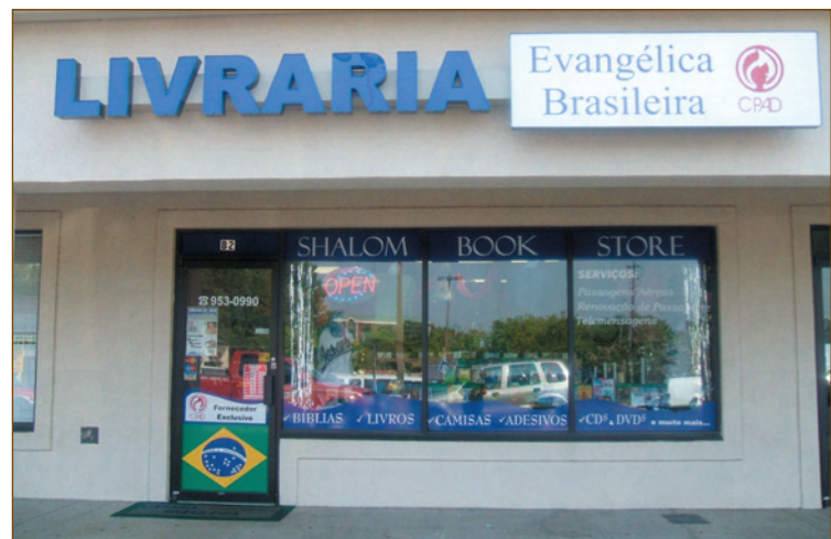
Bookstore in Delk Village Shopping Center

Some Brazilians who live in metro Atlanta are trained engineers and lawyers, but they are working blue-collar jobs because of their undocumented status.