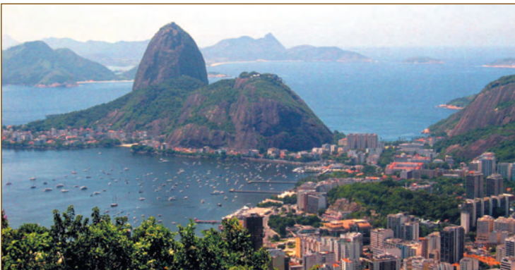
Rio de Janerio, Brazil