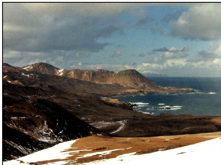
Amchitka Island; View From the East End Looking North

Drilling at the three nuclear test sites and the three emplacement/exploratory locations used large quantities of drilling mud, which consisted of water, diesel fuel, and other additives, including bentonite, chrome lignosulfonate, chrome lignite, cement, paper, and sodium bicarbonate. The drilling mud pits were left in place when AEC completed the tests and remained open until DOE began reclamation work in 2001. Chemical analysis of mud pit samples collected during a 1998