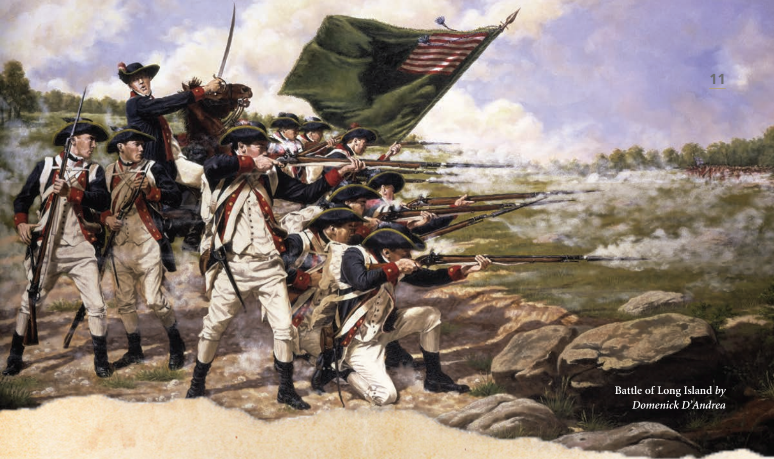
Battle of Long Island by Domenick D'Andrea