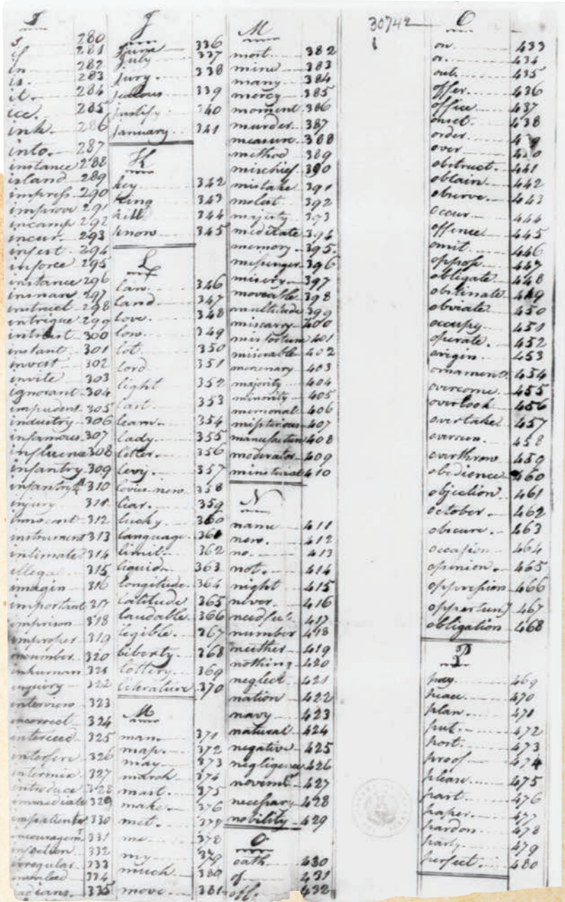
Culper code book